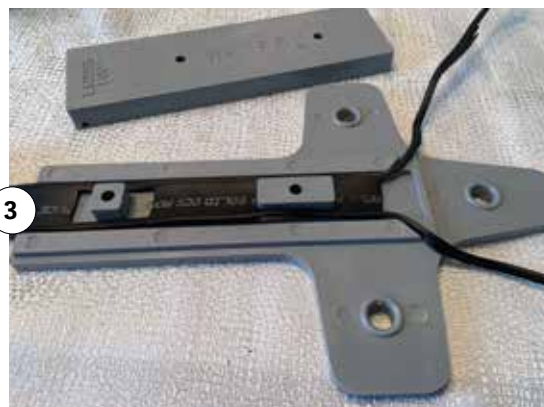
Depending on the type of center insulator/connector you choose, you may need to trim away some of the ladder line insulating sections. In this example, we're using a WA1FFL Ladder-Loc, so we needed to cut away enough insulation so that the ladder line will fit properly.