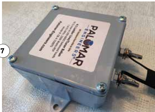
Attach the windowed ladder line to the balun. In this example, the balun posts have wing nuts. These often make attachment easier because you can simply tighten the wing nuts with your fingers.

Regardless of the amount of ladder line you use, you should still find that this single antenna system puts you on the air on several bands and does so very well!