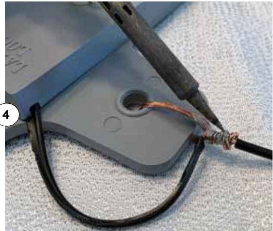
Use solder to attach the ladder line wires to each of the antenna wires.