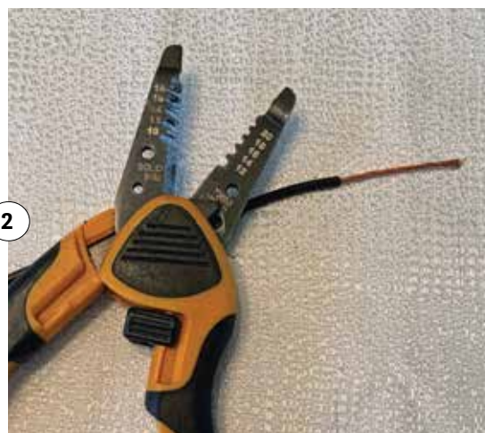
If you are using insulated wire for the antenna, start by removing about 6 inches of insulation at only one end of each of the two lengths.

In this project we're using the WA1FFL Ladder-Loc, as shown in ③. This device provides mechanical support for both the ladder line and the connecting wires. The Ladder-Loc has a cover that is held in place with plastic wing nuts. Remove the cover, and then place the ladder line inside, with the Ladder-Loc support blocks fitting into the center of the line while allowing about 6 inches of wire to extend toward the top. You may need to cut and trim the ladder line again so that it fits properly.