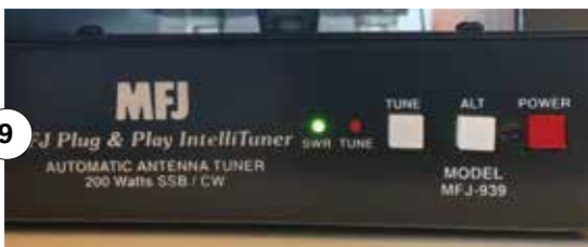
Many automatic antenna tuners light a green LED to show it has achieved the lowest possible SWR.