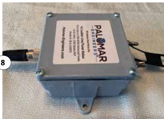
Connect a short length of coaxial cable between the balun and the antenna tuner. (See the left-hand side of the balun.) The shorter the length, the better.