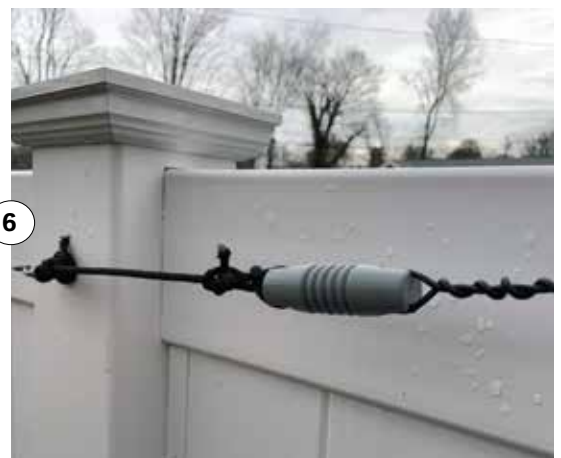
You can hang one end of the antenna from a branch, slope the rest of it at an angle, and secure it near the top of a fence, as shown here. Use whatever configuration you can, according to the space you have available.