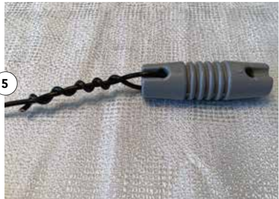
Attach end insulators to the opposite ends of both antenna wires. There is no need to solder. Instead, pull the wire through the insulator hole and then twist it tightly over itself.