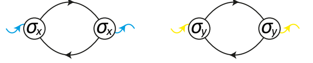
FIG. 1: Self-energy of the collective superconducting mode (amplitude is shown on the left, with blue external lines, and phase is on the right, yellow lines). Black lines stand for semionic propagators.

where we made use of the self-consistency equation (6). Recalling the gradient expansion (2) we have an imaginary time amplitude propagator