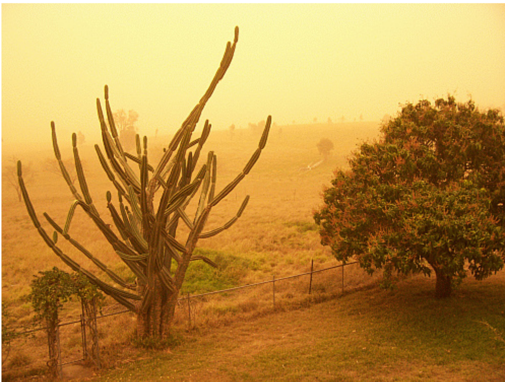
The Day Solar Energy disappeared in the Australian Dust Storm (23/9/09).

Dust on a solar panel will reduce its efficiency by up to 50%. See: http://docs.google.com/present/view?id=dfhw7d9z_0gtk9bsgc