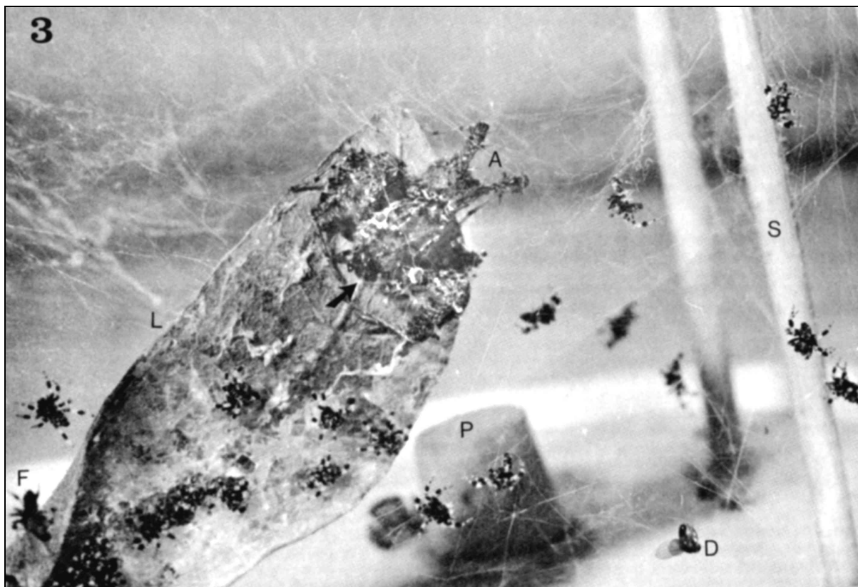
Fig. 3. Female Portia fimbriata (A) stands, facing downward, on leaf (L) suspended in her web while feeding on another species of salticid (arrow). Web is built in a specially designed cage with vertical sticks (S) protruding from plastic platform (Phibbs and Jackson in press). First instar spiderlings are dispersed across leaf and within web. D: Drosophila melanogaster caught in web. F: spiderling (out of focus) feeding on Drosophila in web. P: rubber stopper plugging hole in cage.