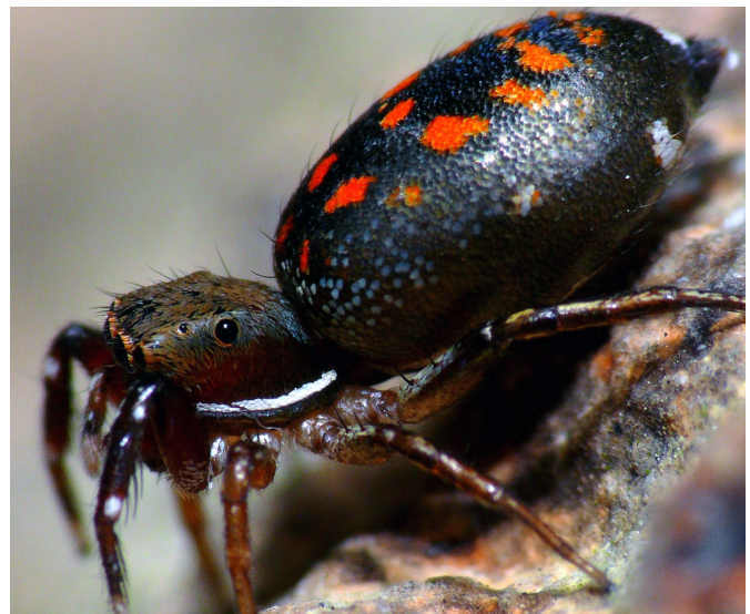
Fig. 3. Gravid female Natta horizontalis Karsch 1879 (type of Natta ), from Richards Bay, South Africa. If you zoom in on this remarkably detailed photograph, you can see individual rounded scales on the opisthosoma, and the more frequently encountered elongated scales on the prosoma. The overlap of the array of opisthosomal scales is much greater when this spider is not gravid. This species is widely distributed across the African continent. 3