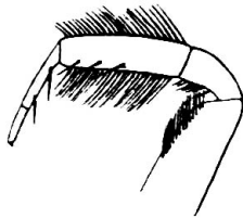
Fig. 1. Simon's illustration of the elongated brush of dark black setae on tibia I of a male Cyllobelus semiglaucus (Simon 1901b, p. 541, labeled K in grouped figs. 654-669, or fig. 664). 3

Simon (1901a, 1901b) described S. semiglaucus (as Cyllobelus semiglaucus ), and figured the prominent bottle brush setae on tibia I of a male (fig. 1).