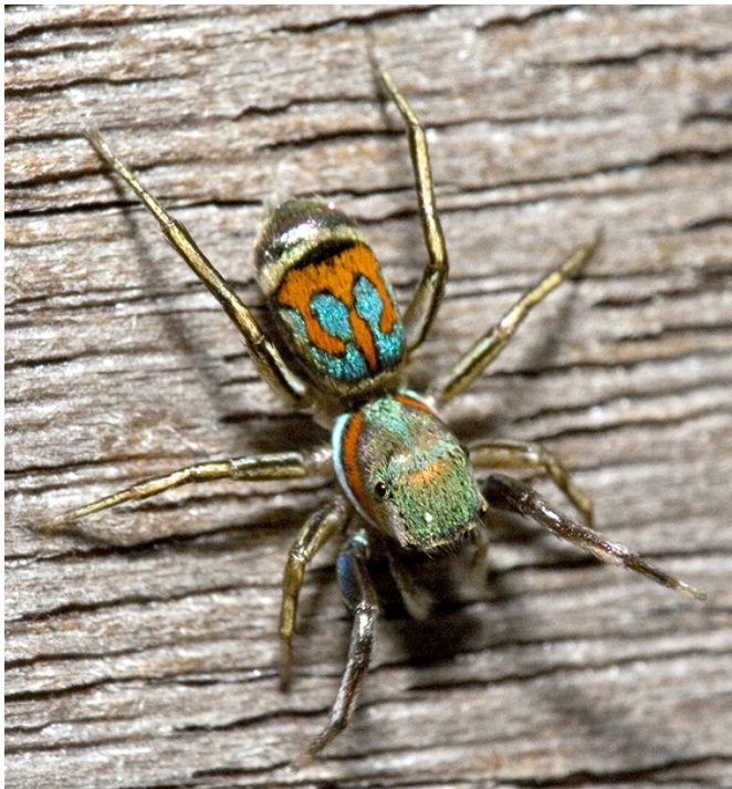
Fig. 4. Female Siler semiglaucus (Simon 1901a), from Singapore. 3 Note the absence of the dark black bottle brushes found on tibia I of the male. The areas of bright, iridescent blue scales are joined on each side of the opisthosoma.

Several color photographs, at least of female Siler semiglaucus or a related species, are available (Murphy and Murphy 2000, Prószyński 2000b). The female Siler shown here (fig. 4), from Singapore, is similar to those earlier photographs of S. semiglaucus .