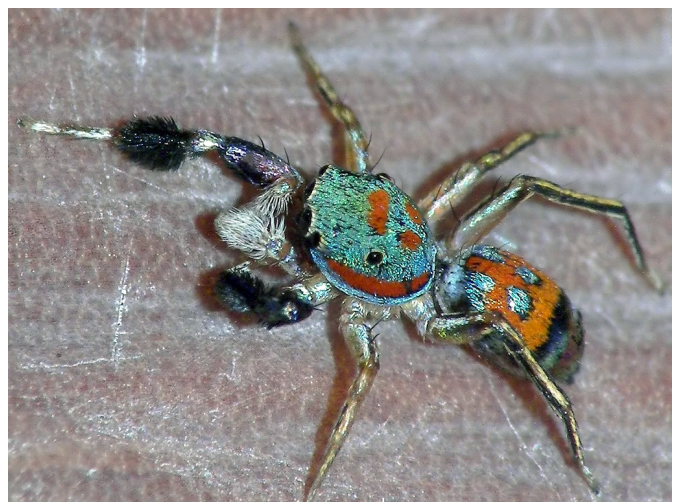
Fig. 6. Second view of the adult male Siler from Hong Kong shown in fig. 4, with a lateral perspective. 3 In this lateral view, the long, black dorsal-ventral bottle brush setae of the male tibia I can be seen clearly, as well as a smaller group of dark setae on the underside of femur I.