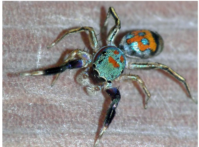
Fig. 5. Dorsal view of an adult male Siler from Hong Kong. 3 The dorsal-ventral bottle brushes on tibiae I cannot be seen in this dorsal view. Note the distinct separation of two patches of iridescent blue scales on the dorsal opisthosoma. This spider was missing leg L3 (left III).

Prószyński's (1985) description and drawing of the dorsal opisthosoma of S. collingwoodi agree with the male Siler from Hong Kong depicted here in figs. 5 and 6.