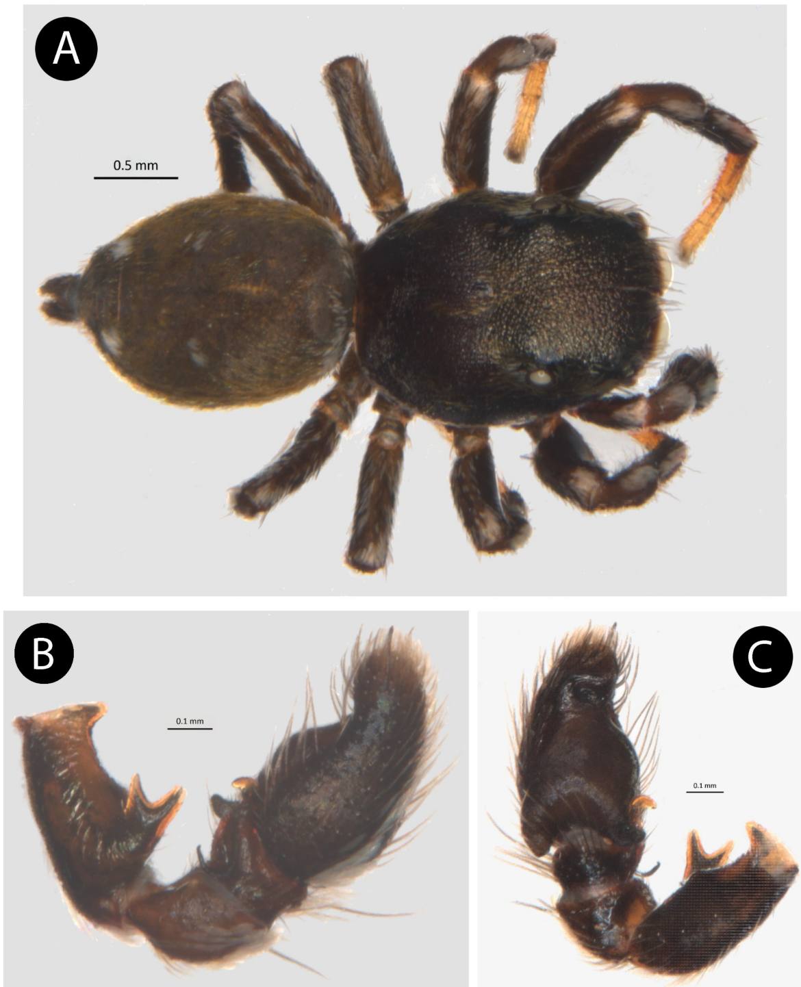
Figure 1. Male Heliophanus kochii . A , Dorsal. B , Palp retrolateral. C , Palp ventral.

Occupants of the residence where the single male of Heliophanus kochii was collected had no history of prior travel outside of the United States. The owner of this residence works in a warehouse that stocks carpeting and other flooring materials, so one possible scenario is that this spider hitchhiked in flooring materials shipped from the native range of this species (e.g., Germany is the source of one vinyl floor covering stocked in the warehouse), and the warehouse worker may have inadvertently transported it to his residence. Another adventive salticid that is native to Europe and Asia, Myrmarachne formicaria , has been collected twice in the same warehouse - see label data below.