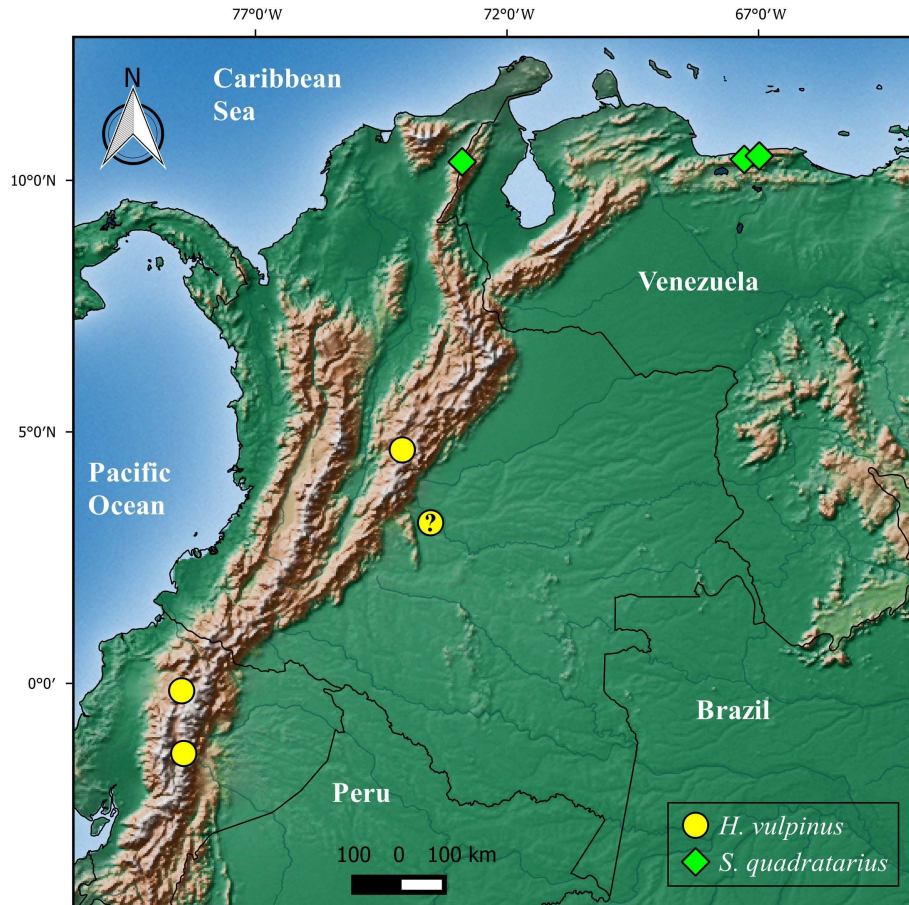
Figure 13. Known distribution of Hurius vulpinus Simon and Simonurius quadratarius (Simon) in South America. The record of H. vulpinus with a “?” corresponds to an unknown locality in the Meta department, Colombia.

Distribution. Colombia (Magdalena) and Venezuela (Aragua, Distrito Federal) (Figure 13). The Colombian specimen was collected beating a frailejón ( Asteraceae: Espeletia sp) in a highly intervened Páramo ecosystem. This is a new genus and species record for Colombia, representing the northwesternmost record for both Simonurius and the tribe Huriini. The known altitudinal range is 1290-3200 m.