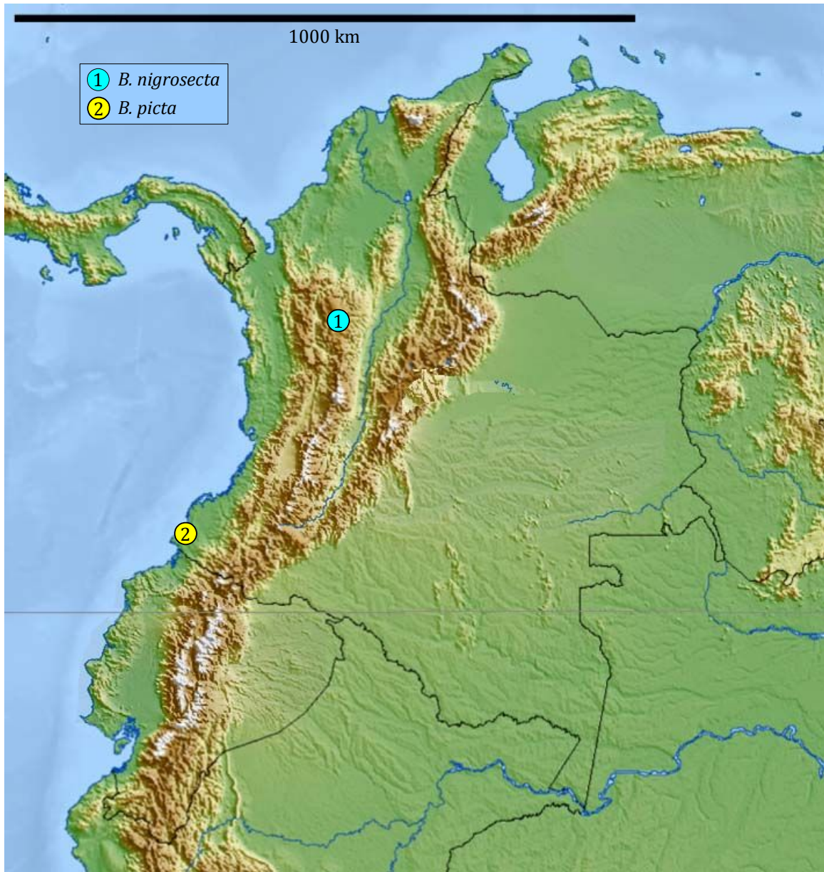
Figure 8. Known distribution of the genus Balmaceda in Colombia. Map by Mapswire.com ( https://mapswire.com ) used and modified under a Creative Commons Attribution 4.0 International (CC BY 4.0) License.