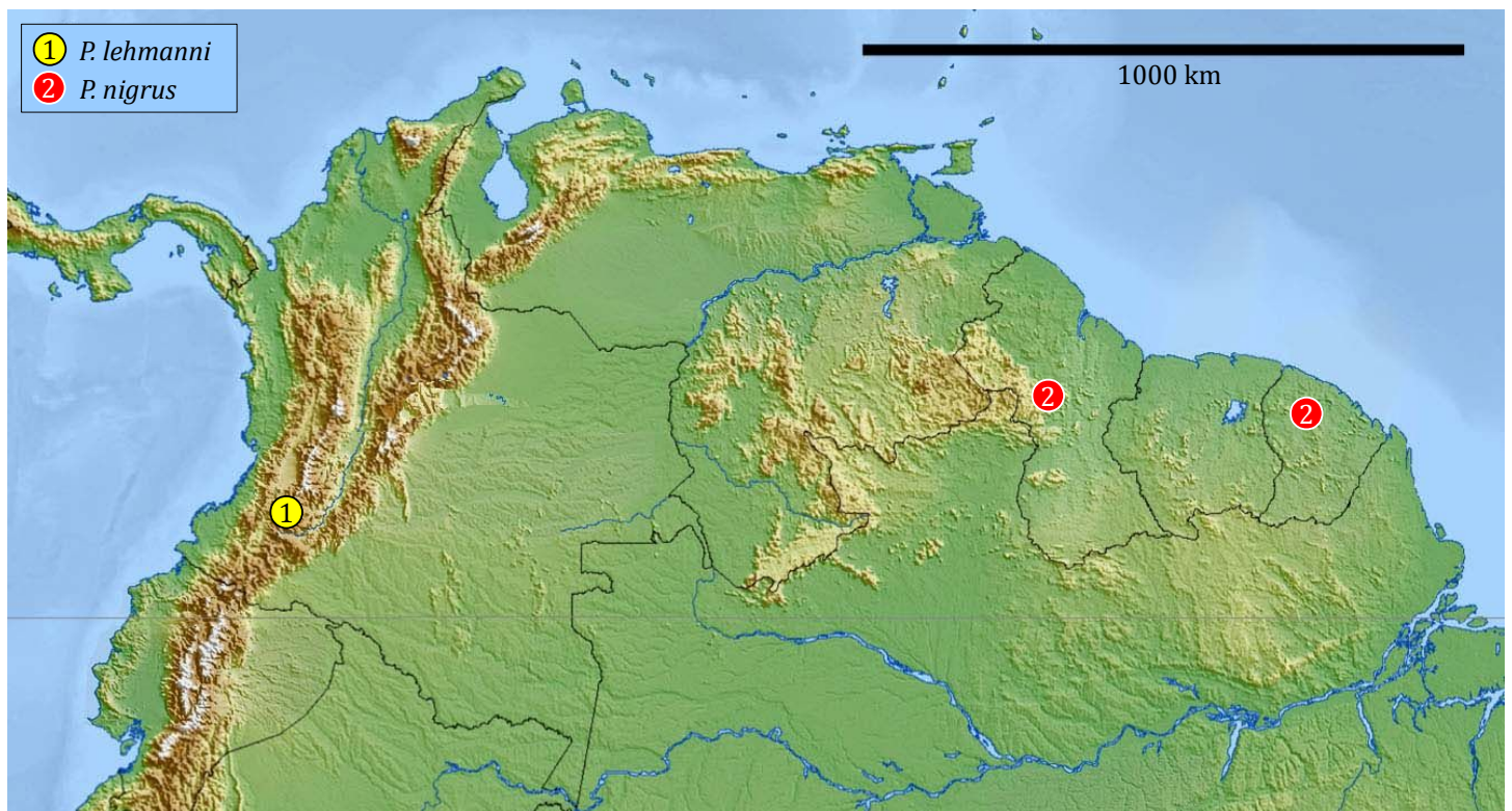
Figure 4. Known distribution of the nigrus species group of Pachomius (Salticidae: Salticinae: Aelurillini: Freyina) in northern South America. Map by Mapswire.com ( https://mapswire.com ) used and modified under a Creative Commons Attribution 4.0 International (CC BY 4.0) License.