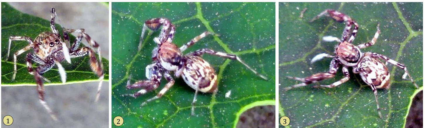
Figures 1-3. Adult female Brettus cingulatus in Ben Tre Province, Vietnam.

Our identification of Brettus cingulatus is based on posted or published photographs and illustrations (Ahmed et al. 2017; Abhijith & Hill 2019; Pai & Hill 2020; Harshith & Hill 2020; Metzner 2021). This species has a primarily south to southeast Asian distribution to include Bangladesh, China, India, Myanmar, Sri Lanka, Sumatra, and Thailand (Ahmed et al. 2017; Metzner 2020; World Spider Catalog 2021). This observation represents the first record of the genus Brettus Thorell 1895 in Vietnam.