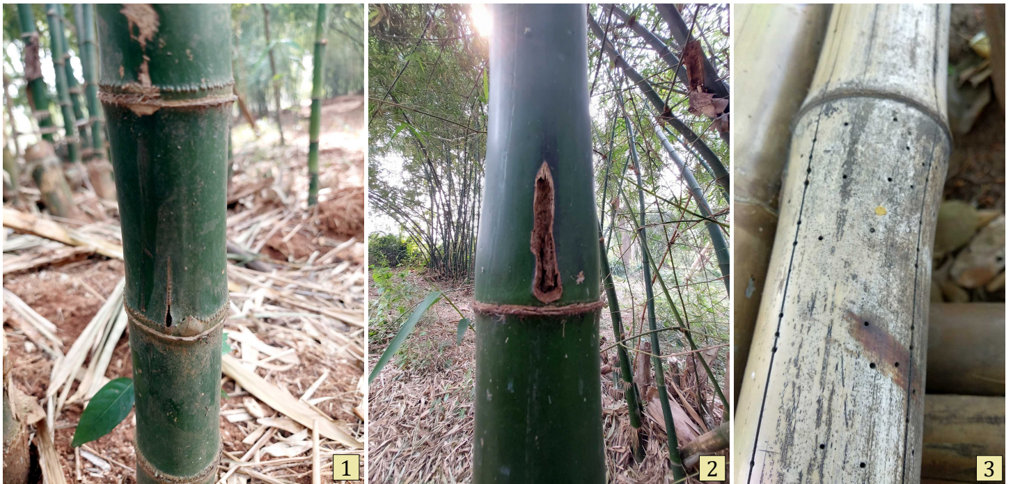
Figure 2. 1, Exit hole of Estigmina chinensis . 2, Damage caused by termites from inside a culm. 3, Small exit holes of Dinoderus minutus .