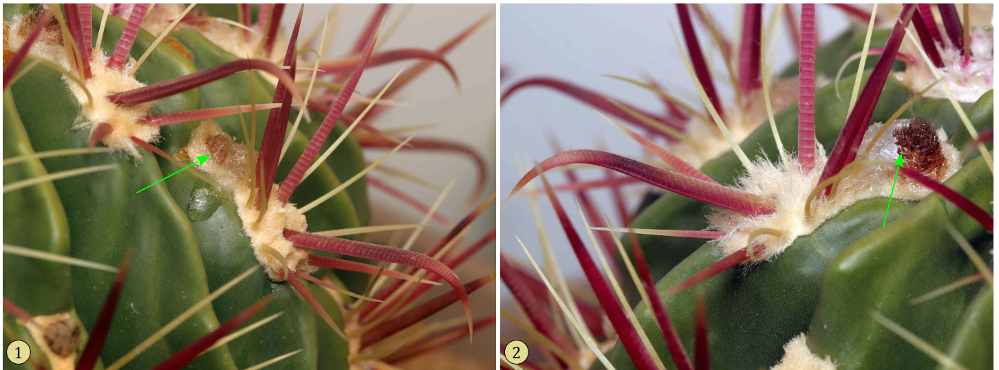
Figure 1. Many cacti, like these Mexican Ferocactus latispinus , have extrafloral nectaries (arrows) that produce a copious supply of nectar for ants and other predatory arthropods. In the absence of these predators, cacti may be vulnerable to a host of herbivorous insects. The formidable spines of these cacti can protect them from the larger (vertebrate) herbivores, but not from the smaller (arthropod) ones.

Introduced plants may have a negative impact on the diversity of herbivores, but they can also provide more niches and thus increase the diversity of predatory species (Litt et al. 2014; Padovani et al. 2020). The cacti (Cactaceae) are an almost exclusively American family of succulent plants that have been introduced into many parts of the world, often as ornamental plants. Cacti rely on their spines for protection against larger herbivores, but they are also vulnerable to herbaceous insects. At the same time their spines can also protect predatory arthropods that feed on those insects and, as a result, many species of spiders live on cacti (e.g., Polis & Hurd 1995; Mendes et al. 2018). To increase the density of protective, predatory arthropods, many cacti have also evolved extrafloral nectaries (Figure 1; Mauseth et al. 2016). In addition, cactus stems can provide not only protection, but also access to prey for a jumping spider.