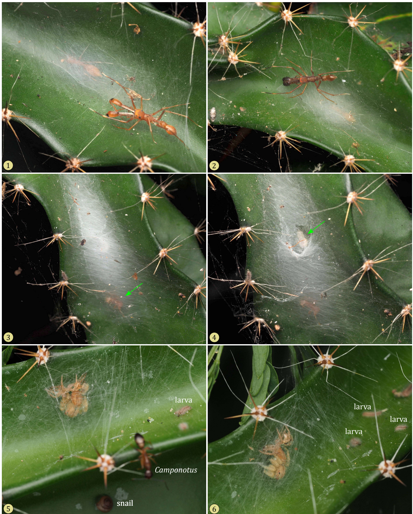
Figure 3. Jumping spiders on Echinocereus . 1-2 , Two different male M. plataleoides tending two different penultimate females. Note the difference in coloration of the two males. 3 , Dead female M. plataleoides (arrow) inside of her nest. 4 , Opening the nest (3) revealed the presence of a pupating hunchback fly (arrow; Diptera: Acroceridae). These are endopredators of spiders, and this one has apparently eaten the female M. plataleoides that occupied this nest. 5-6 , Recently molted juvenile Carrhotus in its shelter, with some other invertebrates that share this microhabitat.