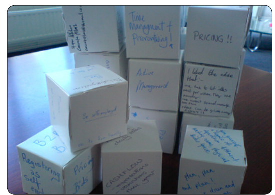
Business Processes for Creatives delivered in association with NCGE 2007

for investment finance from the private sector as well as from bodies such as Venture Capital Trusts (there are several who now operate specialist Creative Industries funds). Furthermore, there is a greater chance that innovations achieved by the organisation can be leveraged for ongoing returns. In the absence of knowledge transfer processes, innovations developed in the Cultural Industries are either not exploited or are taken up by related sectors without establishing a return on the intellectual property for the cultural organisation which created the innovation in the first place.