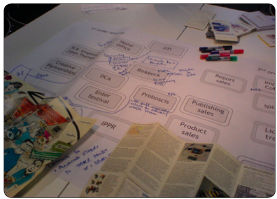
presentation of FO and SO theory in association with Proboscis, ELC & NESTA 2006 \,

and develop as well as to separate the operating assumptions on which SO activities are based from those that FO programme operates. If these operating assumptions are mixed up then decision making seems erratic and unpredictable to those whose role is clearly within the FO programme. The unease that this causes can undermine the role of SO activities within the wider organisation.