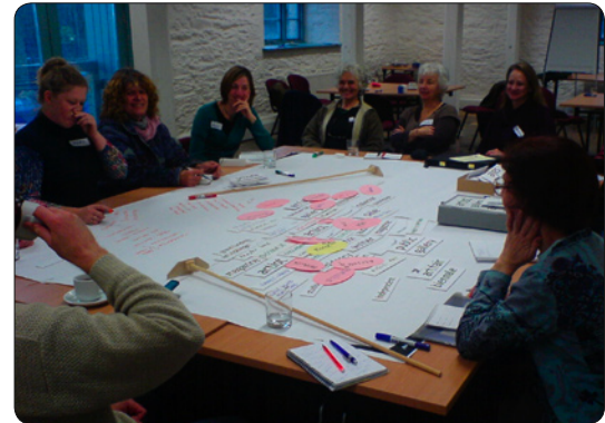
Viewing Platform delivered in association with Emerge & Artquest 2006<sup>1</sup>