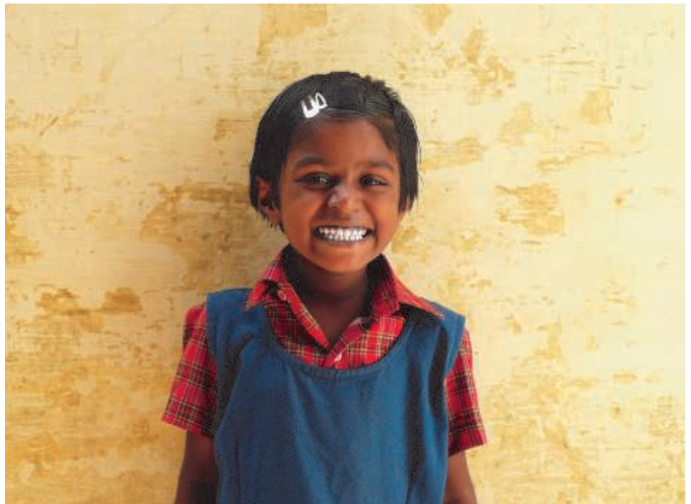
Please brush your teeth.