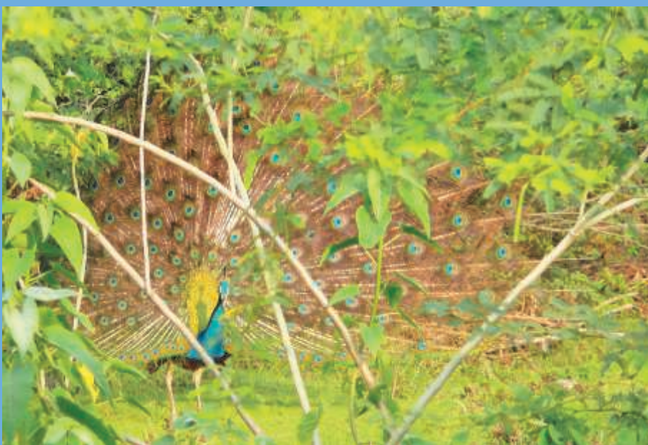
Look at me!