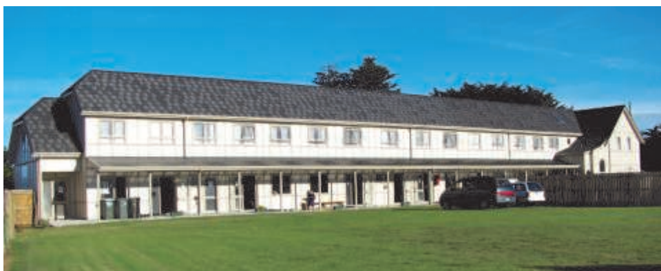
St. Dominic's School (ground floor) and convent (upper floor and side building).