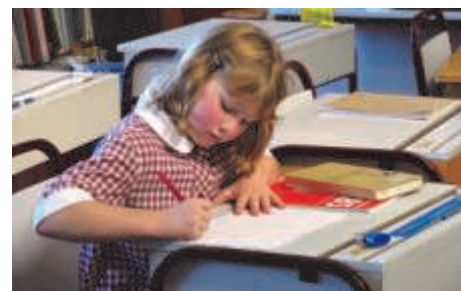
‘Here am I, little Jumping Joan; When nobody’s with me ..I’m always alone.’

senses (sight, hearing) promotes a certain superficiality, shallow thinking, inability to read serious good books from cover to cover, and thus can lead away from the Faith. In our modern times, there is an increase of the disease of obesity, due to over-eating especially junk food; there is also a similar spiritual disease of over-consumption of junk “information” (food