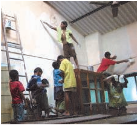
Some paint even landed on the walls.

bert” by the boys – the Society has been asked to take care of the abundant spiritual needs of St. Gonsalo Garcia Ashram and School and perhaps eventually to take over its supervision. Originally founded in 1926, the subsequent survival and growth of the orphanage, particularly through the hard times of the conciliar revolution, were the fruit of Sir Norbert’s perseverance and hard work. Presently nearly 80 boys live on the premises. Many boys are part-boarder and part-orphan having only one parent while about a dozen are complete orphans the real orphans are clearly recognisable during vacation times when their sad faces reveal that they have no other place they can call home. Though the majority of the boys are Hindu, all the boys attend and sing the Mass, say the Rosary daily and participate in all the other prayers of St. Gonsalo Garcia’s. Serving Mass is the privilege of the 9 Catholic boys, but several Hindu lads are always eager to help out in the sacristy. For priests who love boys, St. Bartholomew’s is the place to be.