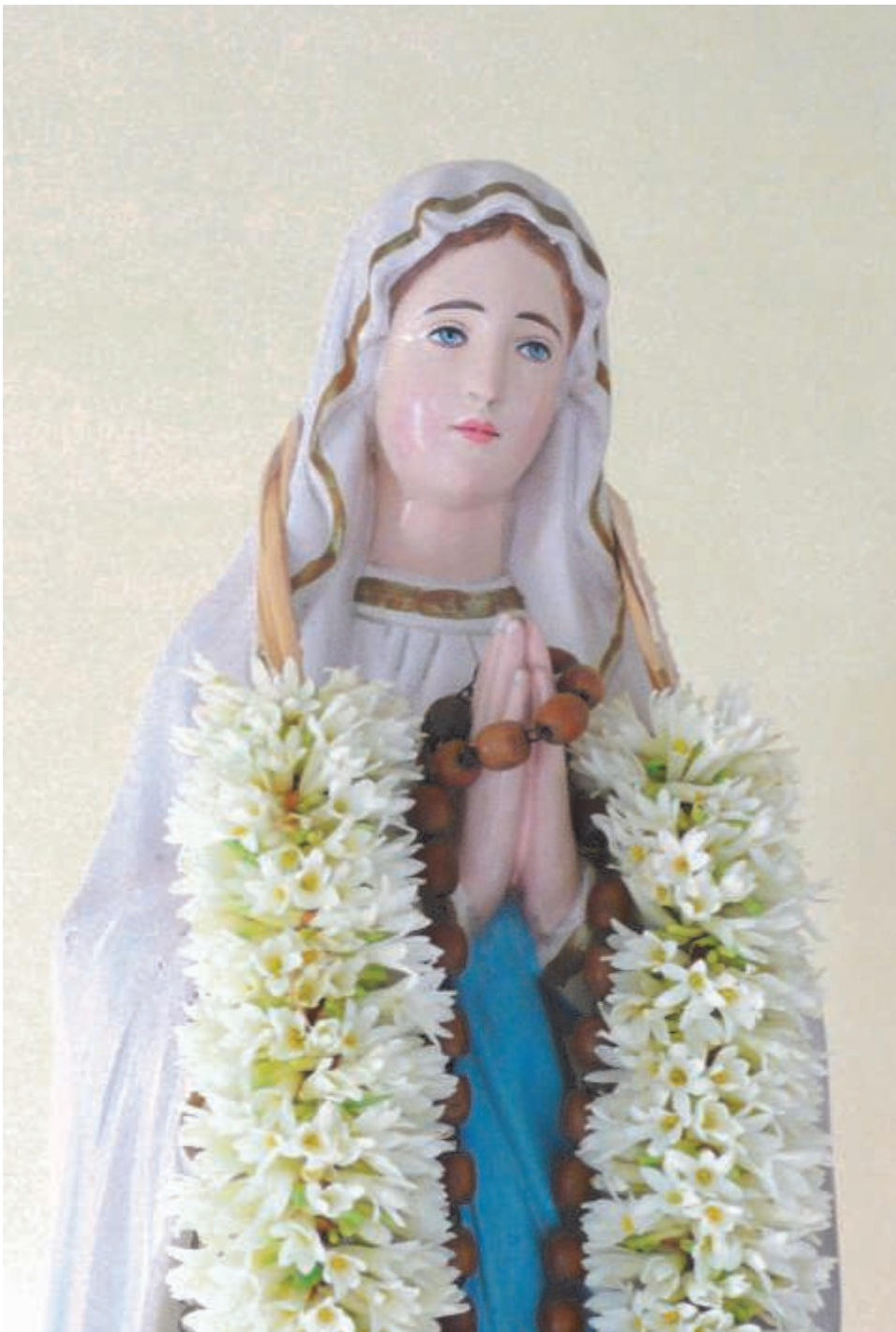
Our Lady of Lourdes, Palayamkottai

Newsletter of Asian District of the Society of Saint Pius X, St. Pius X Priory, 286 Upper Thomson Road, Singapore 574402