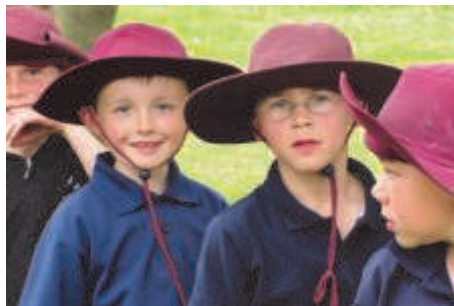
Primary school boys ready—even for sunshine.

For next year, you should already mark two dates. First the feast of the Epiphany, 6th January 2010: God willing, this will be the day of perpetual profession