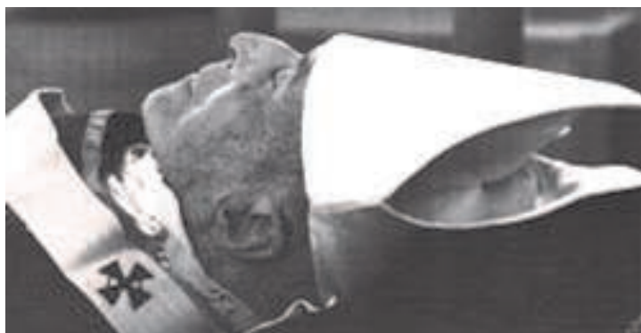
The Archbishop with the pallium (received from Pius XII): “We adhere to the Eternal Rome.”

(Moto proprio Ecclesia Dei 2 nd July 1988)