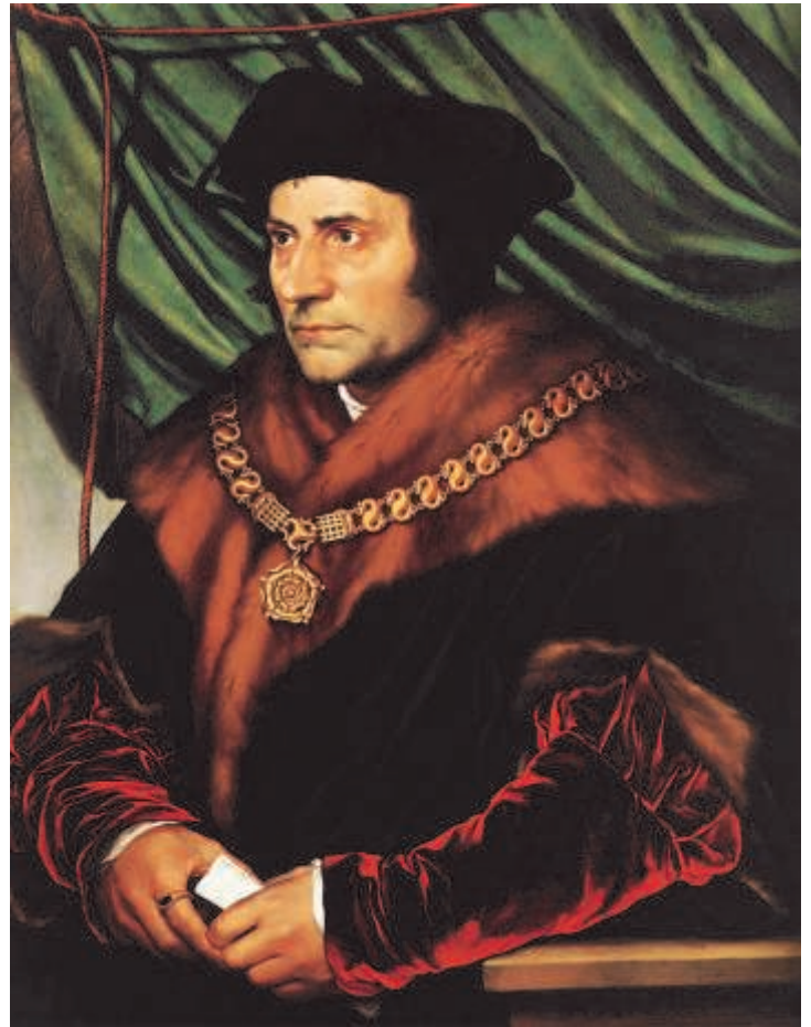
Sir Thomas More, Lord High Chancellor of England.

(The Trial of Thomas More: 1st July 1535)