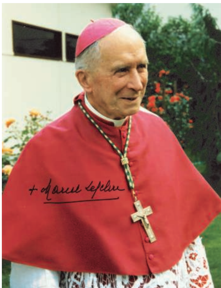
Archbishop Marcel Lefebvre, Archbishop & Bishop Emeritus of Tulle, Founder of the Society of St. Pius X.

“...notwithstanding the formal canonical warning sent to them by the Cardinal Prefect of the Congregation for Bishops on 17 June last, Mons. Lefebvre and the priests Bernard Fellay, Bernard Tissier de Mallerais, Richard Williamson and Alfonso de Galarreta, have incurred the grave penalty of excommunication envisaged by ecclesiastical law.