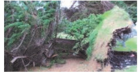
A large Macrocarpa tree came down in the playing field at the school.

I must extend my heartfelt gratitude to the many faithful throughout NZ who contributed so many items – from garden tools and kitchen appliances to pianos for this year's annual Gala. The Gala was a huge success, raising just over $10,000. The number and quality of stalls were