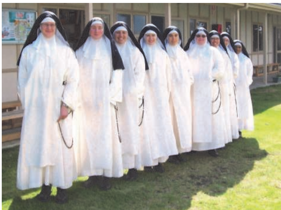
The Community left in Wanganui, New Zealand