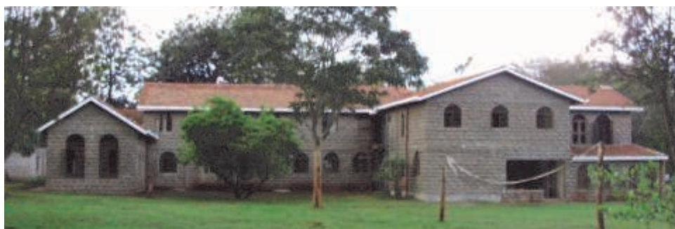
Our Lady of Angels House

Contact: ourladyofangelsnoviciat@gmail.com