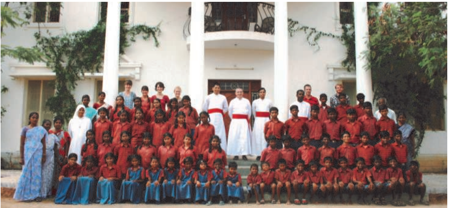
Veritas Academy 2011-12.

May God grant us priests, teachers and plenty of children for our schools. May Catholic parents receive the grace to love their children enough to make the sacrifices necessary for their Catholic education. May our heavenly Mother, our Sedes Sapientiae , hold our schools in her tender care. Ω