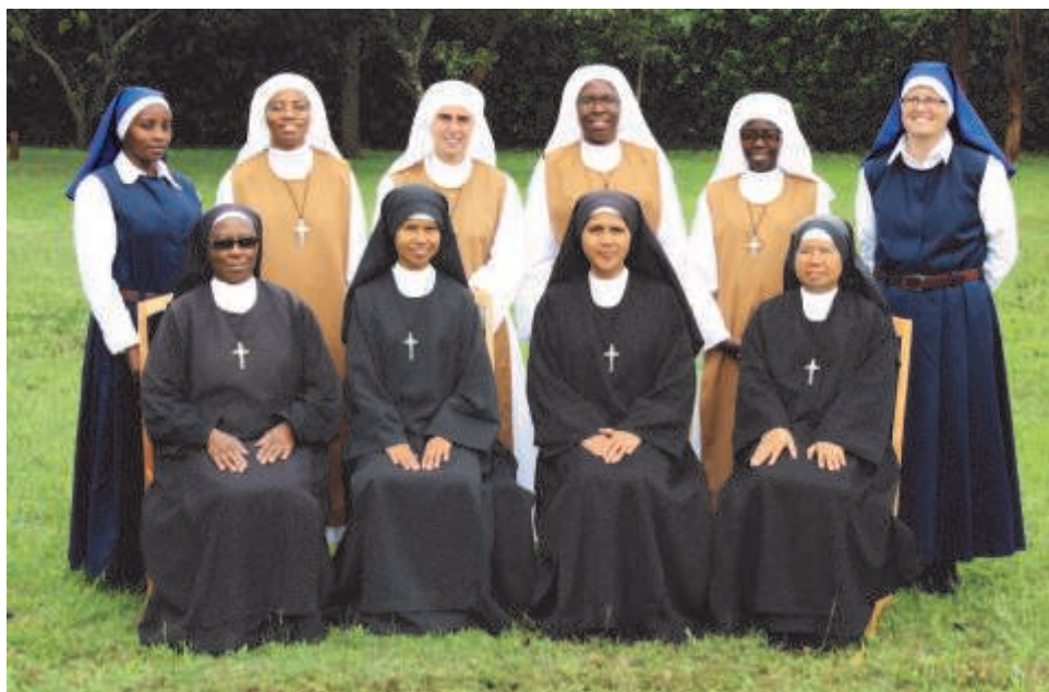
Front row: The Oblate Sisters of the Society of St. Pius X Back Row: The Missionary Sisters of Jesus and Mary