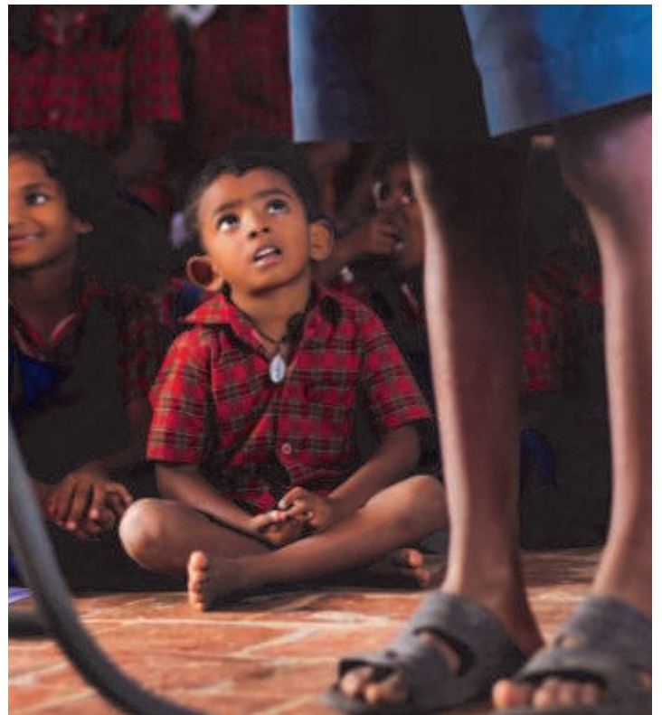
"One day I want to be like him." Brighten looks up to his role model.

§65. Far too common is the error of those who with dangerous assurance and under an ugly term propagate a so-called sex education, falsely imagining