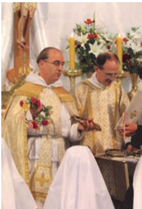
“Roses or Thorns?”.