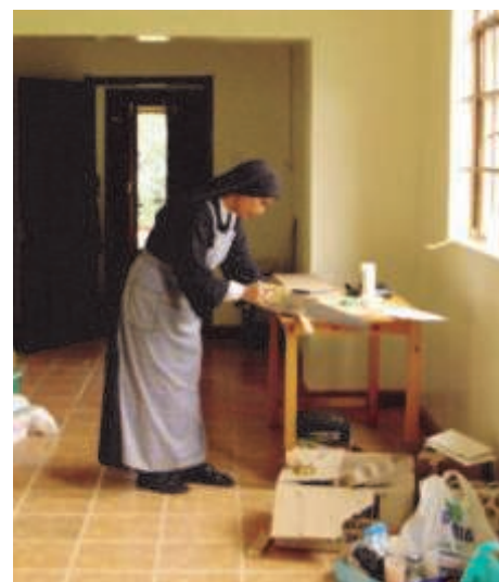
Sister has a great devotion to St. Joseph.

The whole community also has some moments of relaxation. Every day the sisters go for a walk after lunch for about half an hour, and on second Wednesdays, the novices and postulants go for a long walk for the whole afternoon. On the last Wednesday of the month the whole community goes out for a picnic at a green park where they spend most of the day in innocent games, not forgetting, of course,