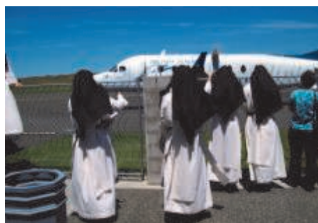
"All aboard for Tynong!"