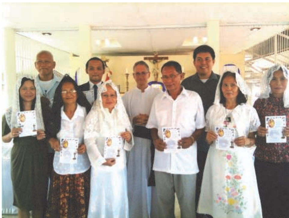
Nine souls were received into the Third Order of St. Pius X at Cagayan de Oro on 11th March 2012. These are the first in the 20 years of the Philippine mission, but they will not be the last for there are more preparing to be received in October or November 2012.