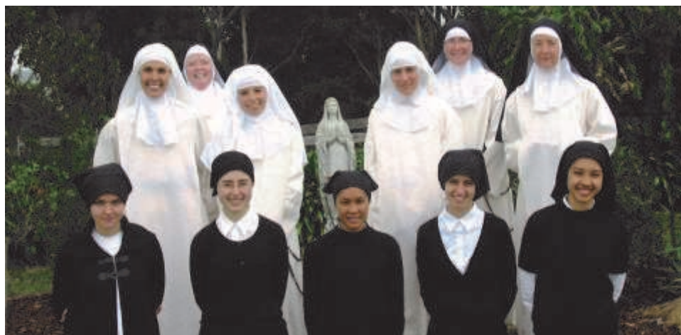
Mother General with community (including one postulant from Singapore and one from the Philippines) in Melbourne, Australia, now the Motherhouse.