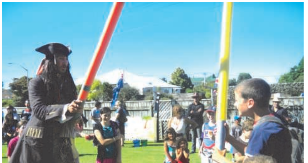
St. Anthony's Parish Gala attracted a number of interesting characters.

Only last October our Avondale Mass centre in Auckland was hit by a tornado which damaged the roofing, fencing and wall of our buildings and property there. In March, 2012 our parish and schools in Wanganui suffered similar losses. However during February the boy's school was burgled losing over $5000 worth of computer and electronic equipment. The school is poor and in much need of these items, so the loss was a real sacrifice for the boys and a small headache for the