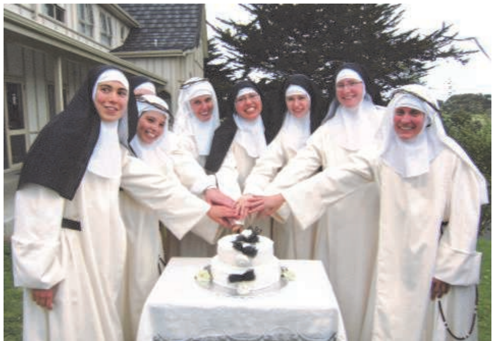
“....and Cake?” The traditional cutting of the cake after the ceremony.