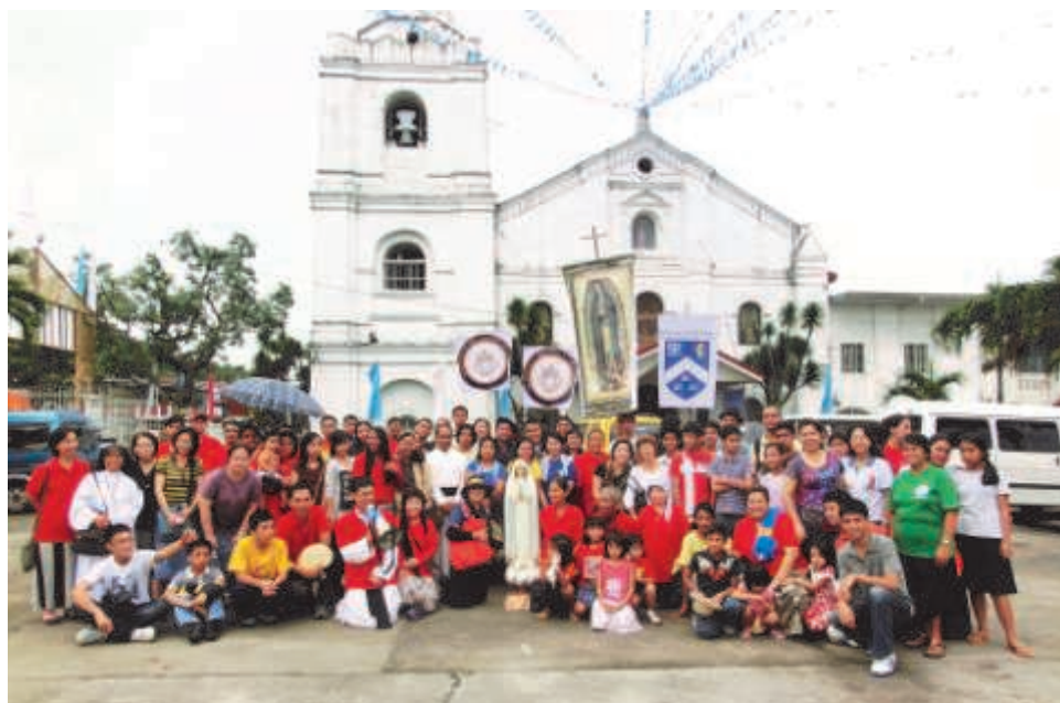
Every year for the feast of Our Lady of Guadalupe, on 12th December, the faithful of the of the Philippines make a pilgrimage to Laguna. The pilgrimage lasts a whole day starting from Pakil and finishing at the church of Our Lady of Guadalupe in Pagsanjan. This year about 200 faithful joined including all the brothers and novices of St. Bernard's Novitiate, Iloilo.