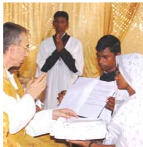
A new pious union for India, the Reparation Sisters of the Immaculate Heart of Mary (2013).

when we read the history of the Missions over the centuries. Leaving Our Lady in the driving seat as ‘her passenger’ and messenger, I witnessed her power, the power of prayer, of the communion of Saints, and saw with my own eyes grace showered everywhere.