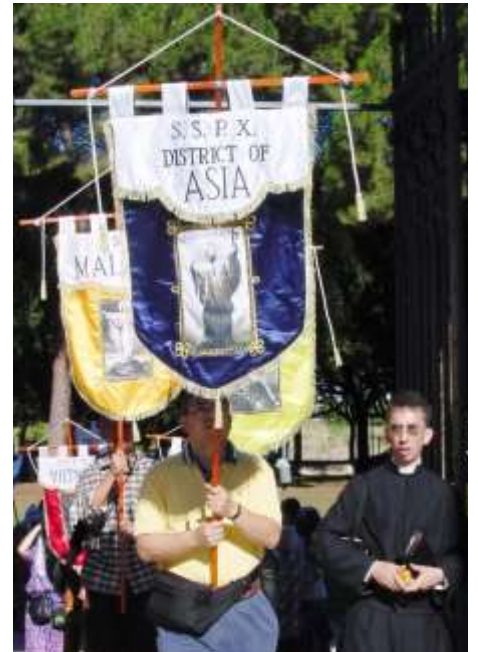
Rome Pilgrimage (2000)

126:4), flying hither and thither, sowing in tears that we may one day reap in joy.