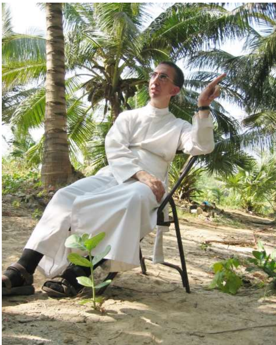
“Er... Yes, just send it on to my new office: District House, Canada.....”