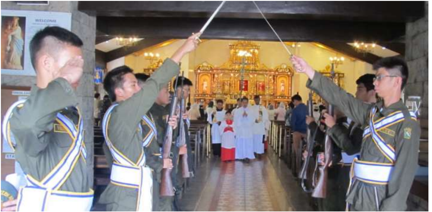
A military guard of honour for the Solemn High Mass on graduation day.