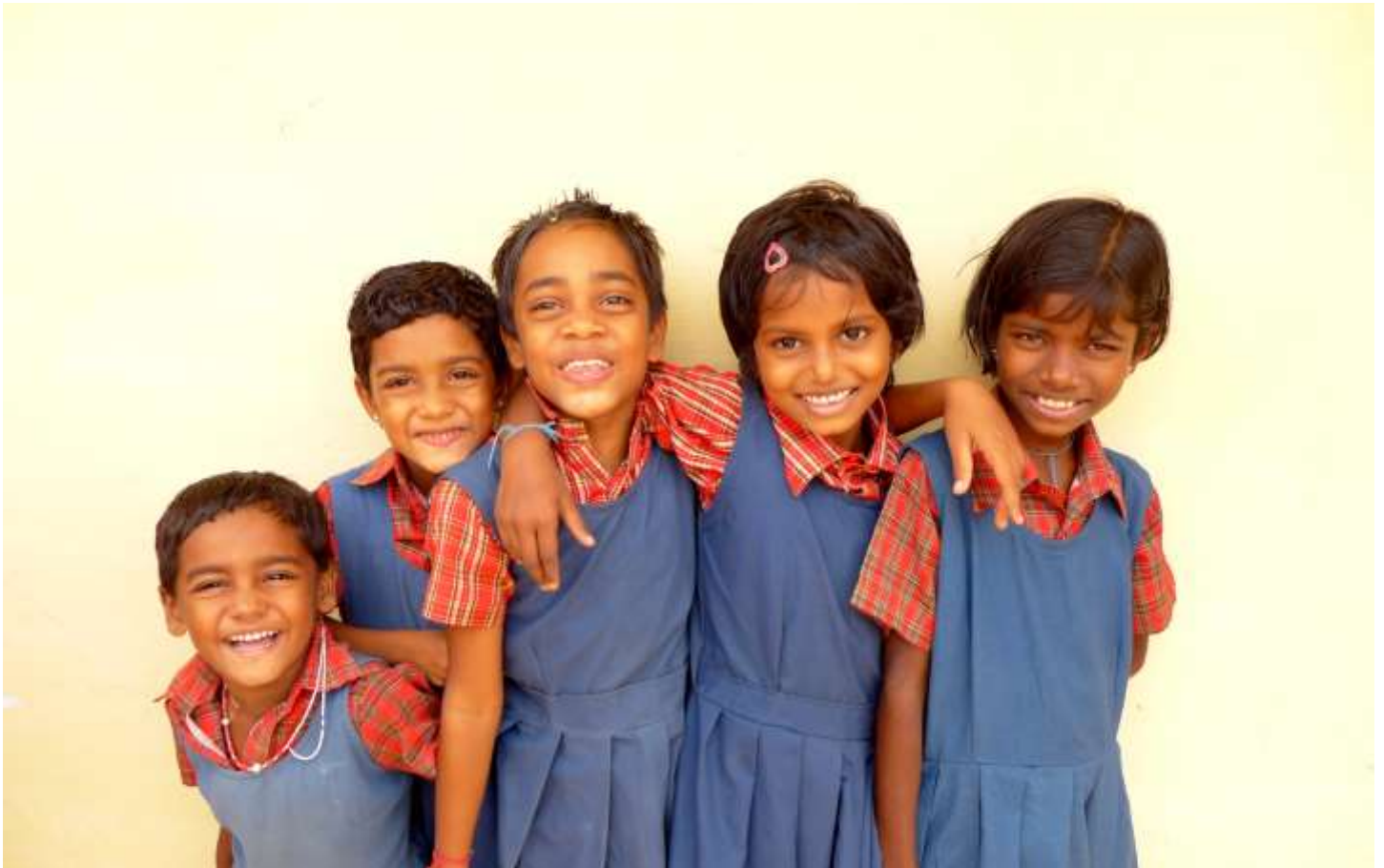
Some Virtues and Angels of Veritas Academy.