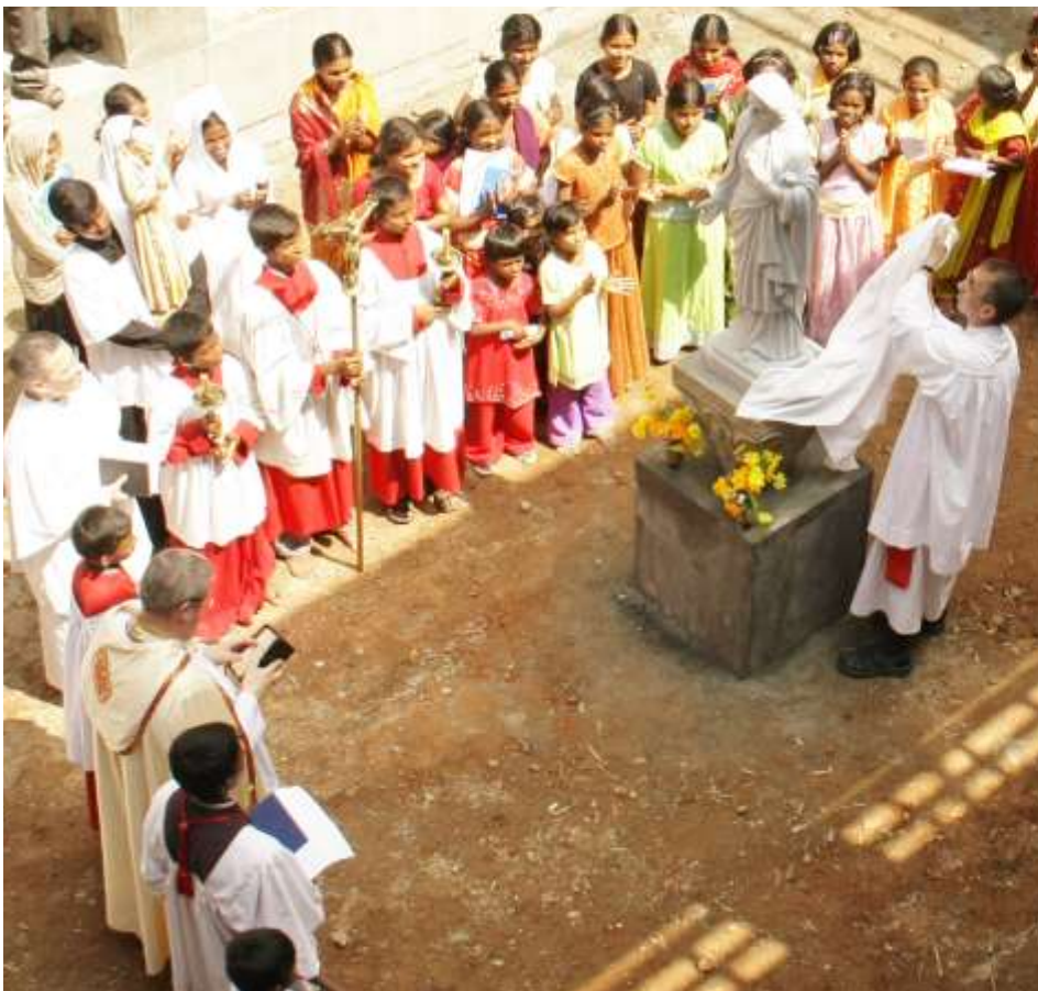
Blessing of the new orphanage building of the Consoling Sisters of the Sacred Heart, India (2010).