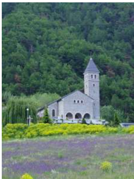
Ecône, Switzerland 1998