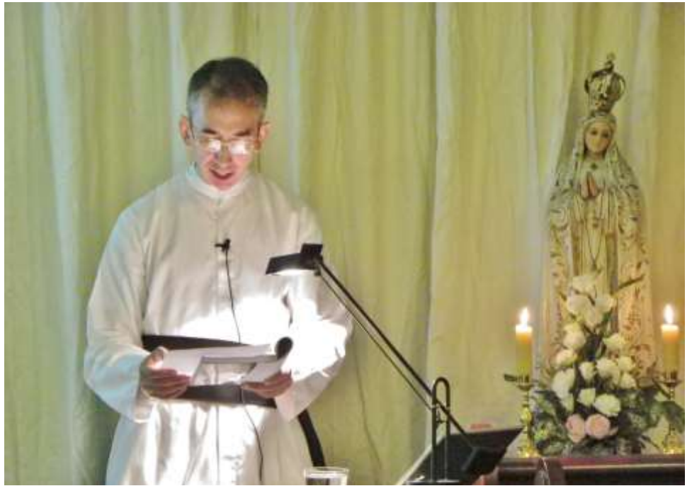
Putting the entire mission in the hands of the Immaculate.