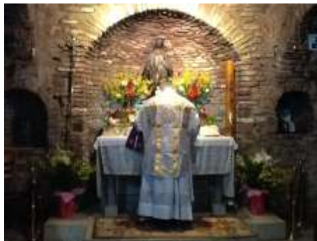
The Holy Sacrifice of the Mass in Our Lady's House.