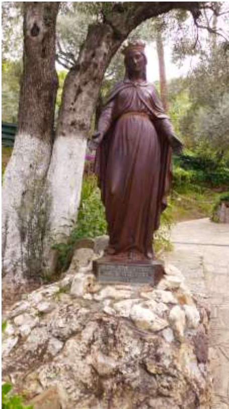
Statue of Our Lady of Ephesus. The inscription reads in French, "They have made me their guardian. 1867."