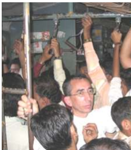
On the metro in Mumbai, India.