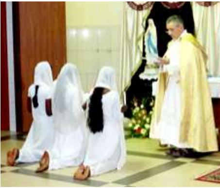
Three young ladies were received into the Sodality of the Children of Mary on the feast of the Visitation of the Blessed Virgin Mary.

of seeing two ladies and one girl from the orphanage receive the sacrament of baptism and two girls making their first holy communion.