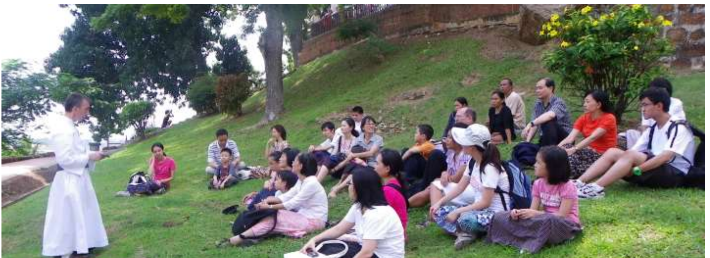
Sermon on the Mount in Malacca (2010).

The third priory we had in 1996 was in India with 3 priests, 8 Mass centers, and approximately 300 faithful. Now they still have 3 priests, but with one brother, two communities of sisters (the Consoling Sisters and the Reparation Sisters, a total of 10 sisters), a priory with 35 boy orphans and boarders, an orphanage and old people’s home with 49 girls and 10 old ladies, one school