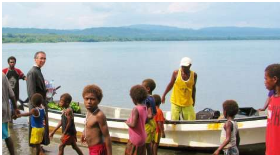
Island hopping in Vanuatu in the Pacific Ocean.

still immense and the workers still so few. At the same time, I ask you not to forget me in my new field of apostolate, my dear Canada.