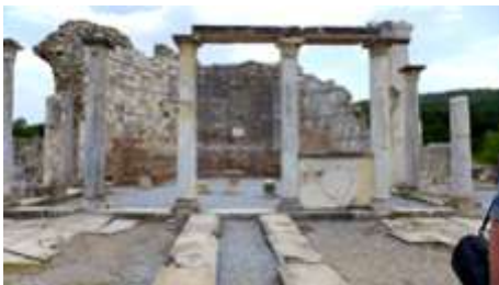
The ruined sanctuary of the Church of Mary—the first church to be dedicated to the Blessed Virgin Mary (c. 430)