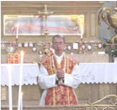
Sermon at the altar of St. Lucy, Venice (2010)

house of Bethany for young ladies searching their vocation, a primary and secondary school (Our Lady of Victories School with 63 students in June 2014) and about 2,500 faithful scattered in 27 regular Mass centers.