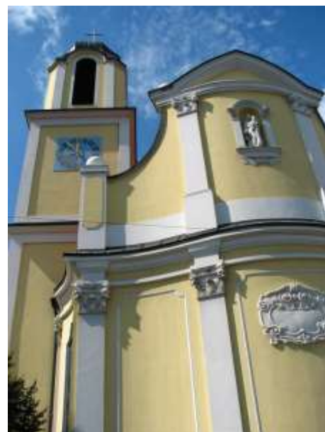
Stuttgart, Germany 1998