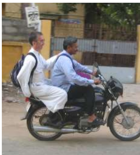
On the moto in Madras, India.