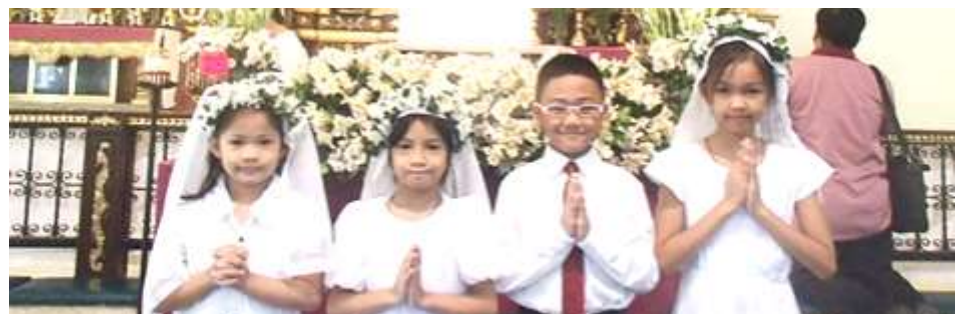
First Holy Communicants on the feast of St. Joseph.