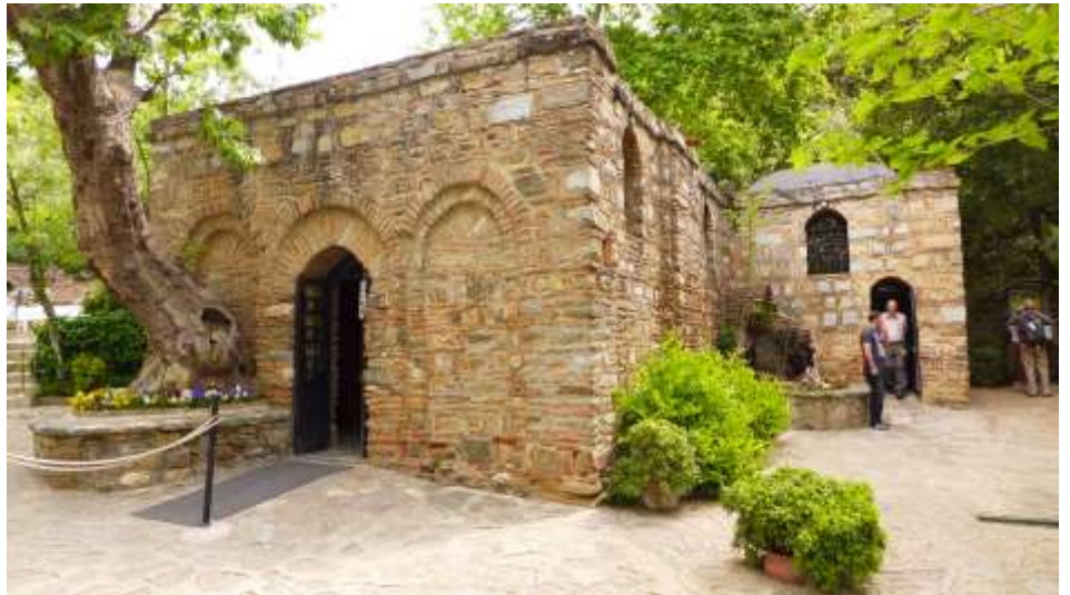
The 1st century foundations of Our Lady's House were discovered in 1881 beneath a 6th-7th century ruin on Nightingale Mountain near Ephesus. The chapel built upon the same foundations is now an edifying and delightful pilgrimage destination.