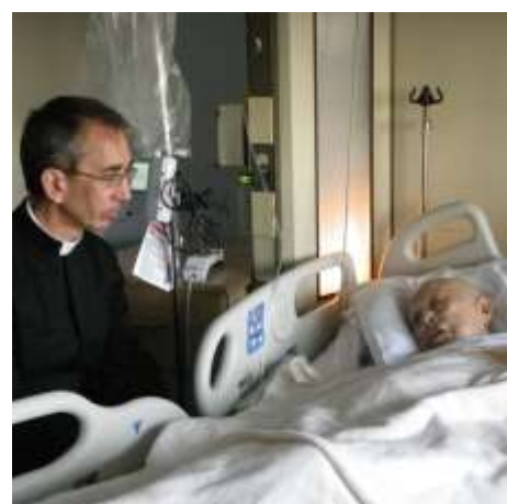
...and was rewarded with a happy death—fortified by the Rites of Holy Mother the Church. (RIP 2013).