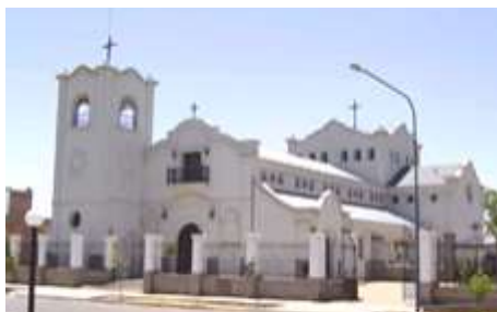
Le Reja 1998, Mendoza 2002 in Argentina.