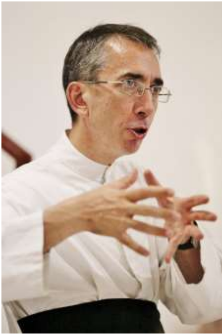
“The faith! ...it’s worth more than a pearl this big!”