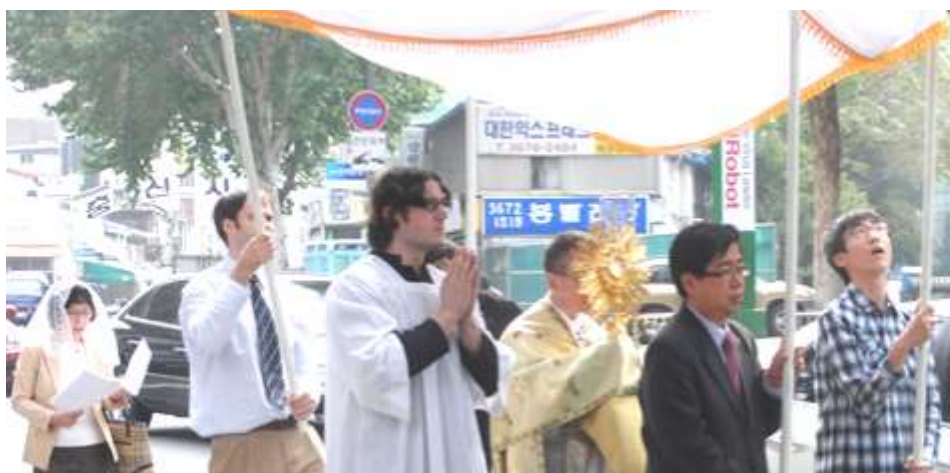
Blessed Sacrament Procession in South Korea (2008)