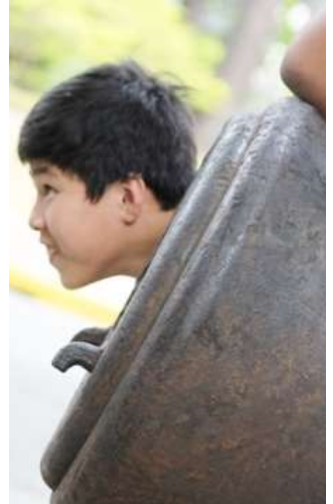
...but another pupil was threatened with expulsion.