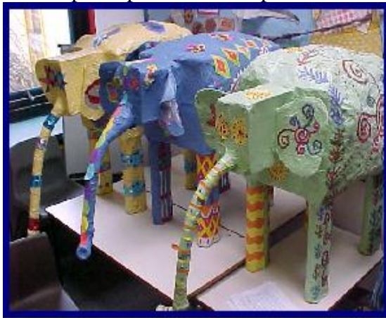
Sample Papier Mache elephants

Invite children to make their elephant using either boxes or inflated balloons and tape. Once satisfied with their design, children can start to add 5 x 7 cm strips of newspaper dipped in glue. (Newsprint must be liberally coated with paste.) Be careful that children cover all parts of their elephant and joints with paper strips. The final layer should be newsprint as this provides a good surface for painting; leave to dry thoroughly. Give the elephants a base coat or two of white paint and then allow the children to paint the final coat in any colour or design of their choosing.