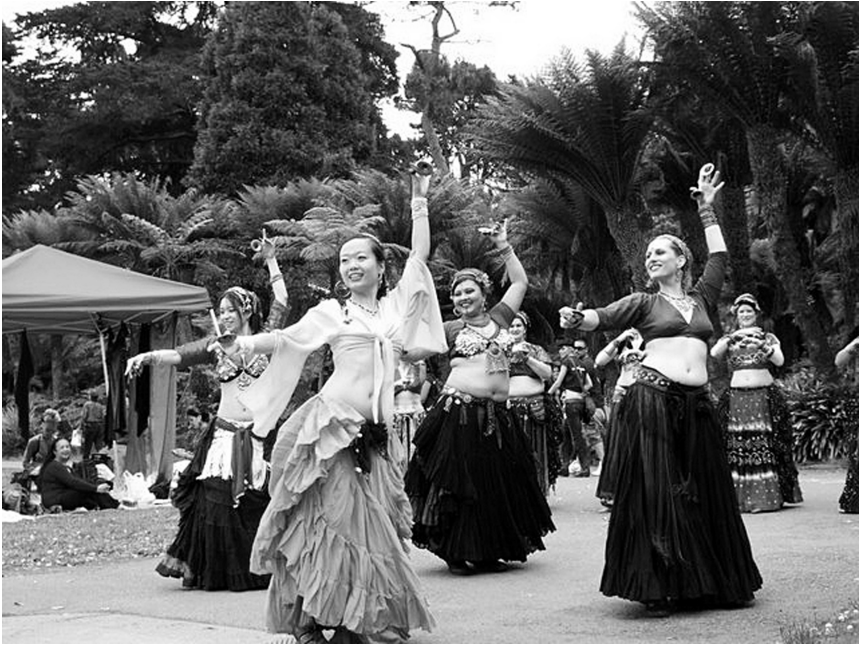
Figure 2. Red Lotus Belly Dance troupe in Golden Gate Park, San Francisco, 2007.

The belly dancing subculture loosely mixes symbols and references to the Middle East, various parts of Asia, and Africa. For example, April and her sisters wear Indian bindis (decorative/adhesive designs) on their foreheads while performing. This fusion of Indian and Arab elements demonstrates the constant impetus to create new styles through the adoption of disparate cultural symbols and movements that are part of the marketing and commodification of belly dancing. Fat Chance mixes belly dance with flamenco and Indian dance, and the dancers wear an eclectic mix of clothing and jewelry: North African, Indian, Afghan, and Middle Eastern. Fat Chance's Web site advertises Indian "fluffy skirts" ranging from seventy-five to ninety dollars, and cholis (blouses), customized for belly dancing, at forty dollars and up. The issue of consumption is important because this is a subculture with specific appeal to middle-class American women who have the income to purchase these belly dancing clothes and accessories, not to mention the time and resources to take classes or, in some instances, travel to shows. 64 Belly dancing has also become a site for capitalist entrepreneurship by women who start their own businesses selling the growing range of belly dance apparel and commodities.