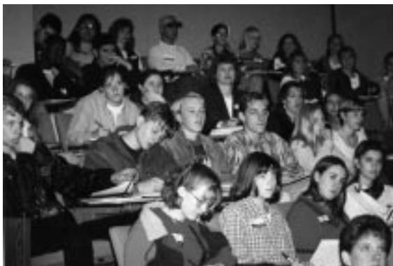
Debaters learned the important role of economics in juvenile crime.