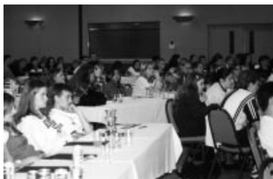
Students at the workshops often heard free-market economic ideas for the first time.