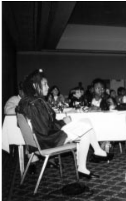
Debaters take notes to add to their research on juvenile crime.

None of this would be possible without the foresight and commitment of Mackinac Center members. Special gifts, such as the Patricia Rodney High School Debate Workshop Scholarship Fund, help thousands of students learn free market economic concepts at debate workshops. Some of their thank you notes are shown here. ❗