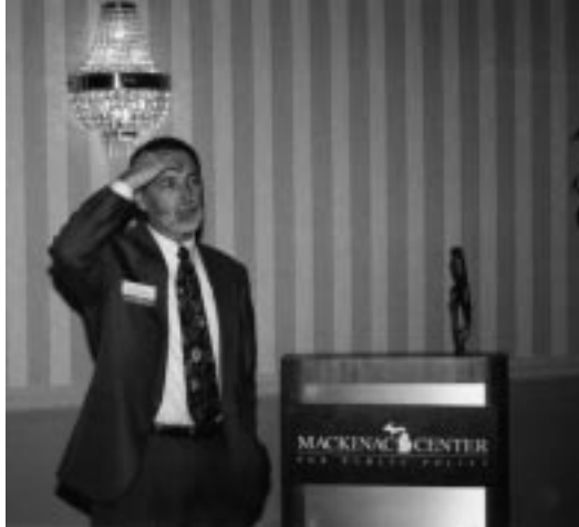
Congressman Pete Hoekstra discusses with the scholars the best way to convey sound economic concepts to the public.

The evening event was followed by a full day of reviews of the past year's Mackinac Center-published research, and presentations by scholars in their