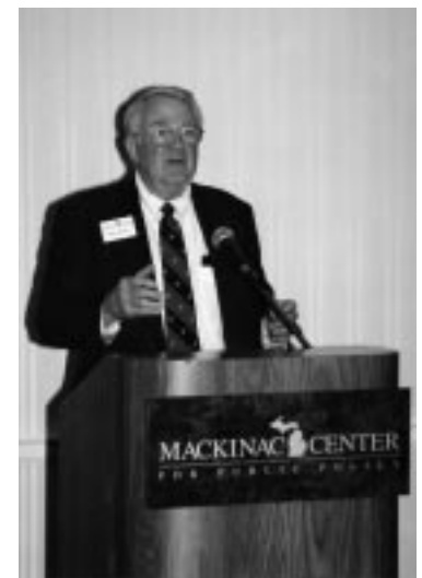
Edwin Meese III told Mackinac Center supporters that local institutions are best suited to help juvenile offenders.

Meese currently holds the Ronald Reagan Chair in Public Policy at the Heritage Foundation, a Washington, D. C.-based public policy think tank. Meese served as the 75 th attorney general of the United States from 1985 until 1988. He was counselor to the president from 1981 until 1985. ■