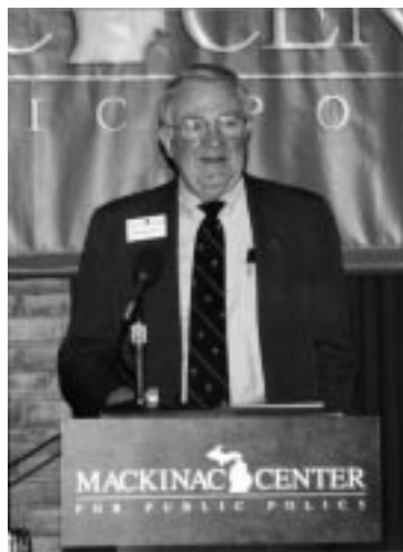
Former U. S. Attorney General Edwin Meese III delighted nearly 200 high school students debate at the Grand Rapids workshop.

Past participants, including teams from (Detroit) Southwest High