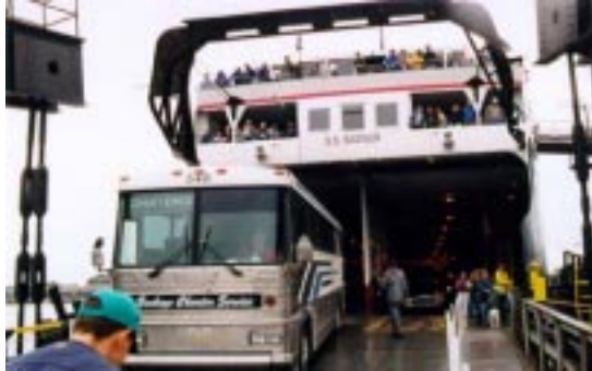
Michigan-based Lake Michigan Carferry Company, which takes customers aboard the S.S. Badger from Ludington, Michigan to Manitowoc, Wisconsin and back, would have faced subsidized competition if the MEDC scheme had gone through.