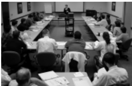
More than 170 public-policy professionals from 35 states and 22 countries have attended the six Leadership Conferences held by the Mackinac Center since 1998.

Attendees of the three-day conference learned the nuts-and-bolts aspects of daily think tank operations as well as the focus and structure needed to effectively advance sound public policy. Senior members of the Mackinac Center staff