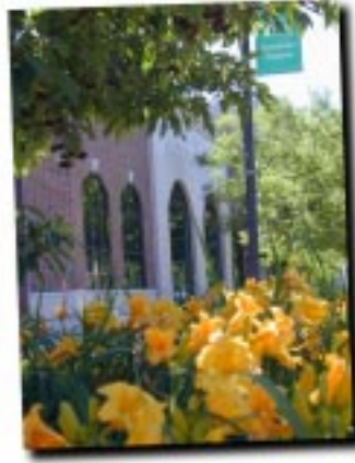
Curious passersby frequently come inside for personalized tours of the Mackinac Center's beautiful downtown headquarters building.

“All four Midland foundations who supported the Mackinac Center's headquarters building are delighted that