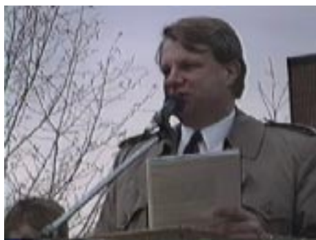
Democratic Party Chair Mark Brewer brandishes a Mackinac Center study and tells union protestors that Michigan's economy is doing badly despite the lowest rate of joblessness in 20 years.

Over 200 local USW members and supporters armed with candles and signs encircled the Center's Midland headquarters as part of the union's nationwide campaign supporting protectionist trade policies and compulsory unionism for workers.