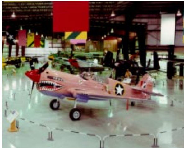
Proponents of Kalamazoo’s “Legacy of Flight” air museum received less than 8 percent of the state funding they wanted after legislators read a Center essay exposing the boondoggle.

countered arguments that the theme park would create 1,700 jobs and attract over 800,000 paying visitors annually by citing the