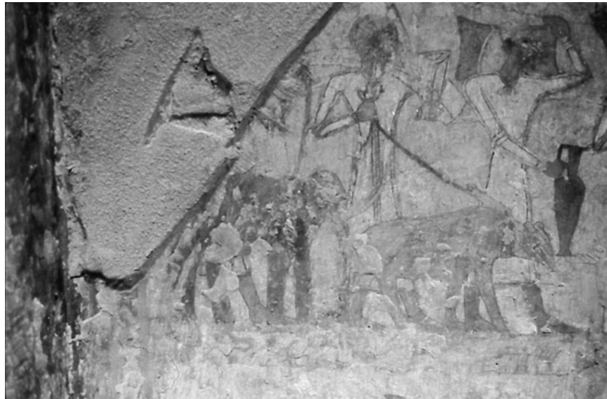
Fig.2 - Detail of the wall-painting of the tomb of Rekh-mi-Rē, at Thebes (Egypt), showing a small-sized elephant borne by the Syrian tributaries.

figures is the result of stylistic convention rather than naturalistic representation (cf. Pirenne 1962, Aldred 1984). It can be observed, however, that this conventional Egyptian method of portraying the size of animal and human beings is not consistently adopted in the wall-decoration of the Rekh-mi-R tomb. The tusks of the portrayed specimen are in fact much smaller and inconsistent with those shown being carried by the Syrian to the right, and the Minoan and Nubian bearers pictured in other sections of the wall-painting (cf. Evans 1928). This incongruence contrasts with the representation of other animals in the same picture. For example, the giraffe portrayed with the Nubian bearers takes up the entire available vertical space of the register. It therefore seems arguable that rather than with evidence of the stylistic convention to which the artists had to conform, we may actually be dealing with the portrait of a dwarf elephant. But, as already observed, there is no fully convincing evidence for the identification with the morphology of an Asiatic elephant. Thus, it may be possible to trace the morphological characteristics of the proboscidean to geographical species closer to ancient Egypt, possibly even among the