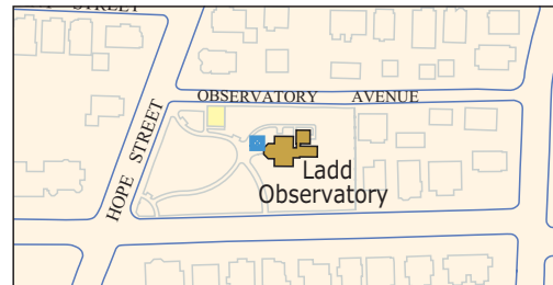
LADD OBSERVATORY 1" = 300'