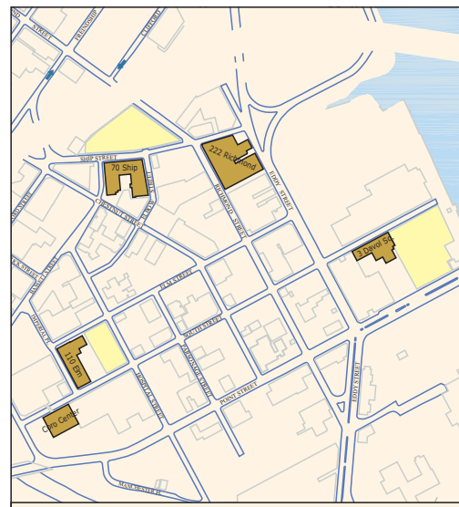
JEWELRY DISTRICT 1" = 750'