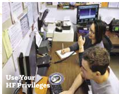
Use Your HF Privileges

Technicians have CW (Morse code) privileges on the 80, 40, and 15-meter bands — learn the code and hone your skills on the air. Techs also have SSB (single sideband) voice and digital privileges on the 10-meter band — despite solar conditions making this band a bit lackluster, string up a simple wire antenna and give 10 a listen once in a while. You never know what you might find!