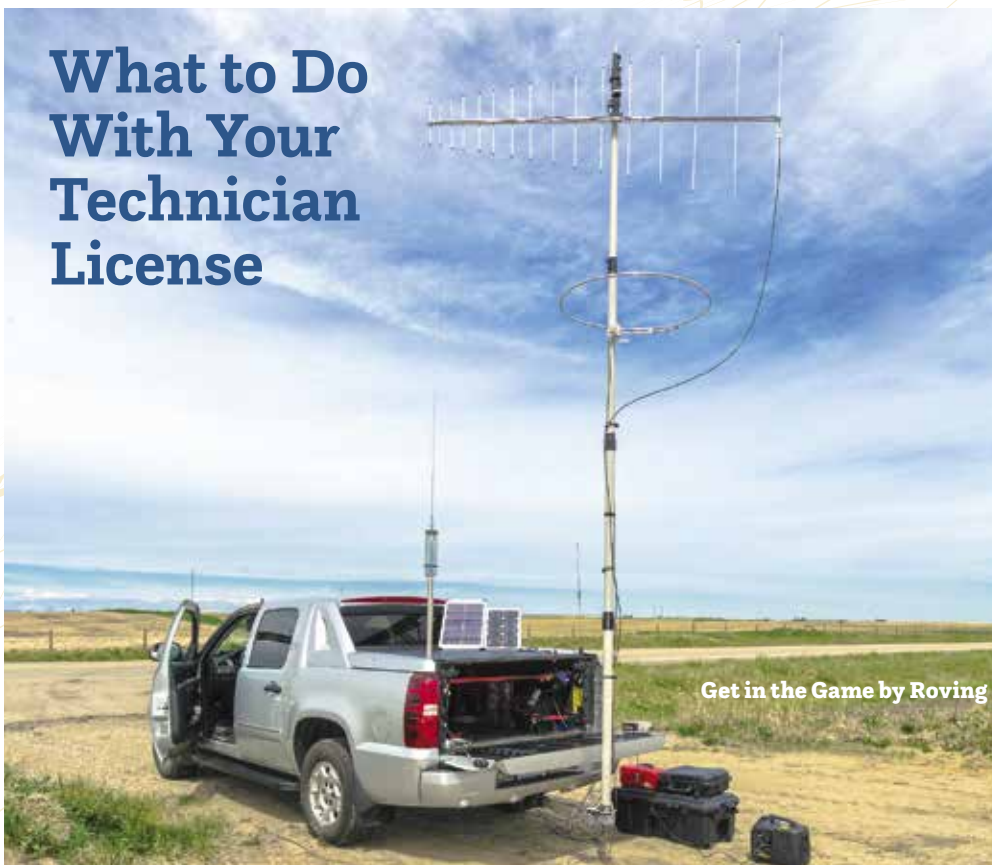
Get in the Game by Roving

Amateur radio offers dozens of activities to match your available time and personal interests. Here's a list of just a few of them. Pick your pleasure – or a few! – and get started.