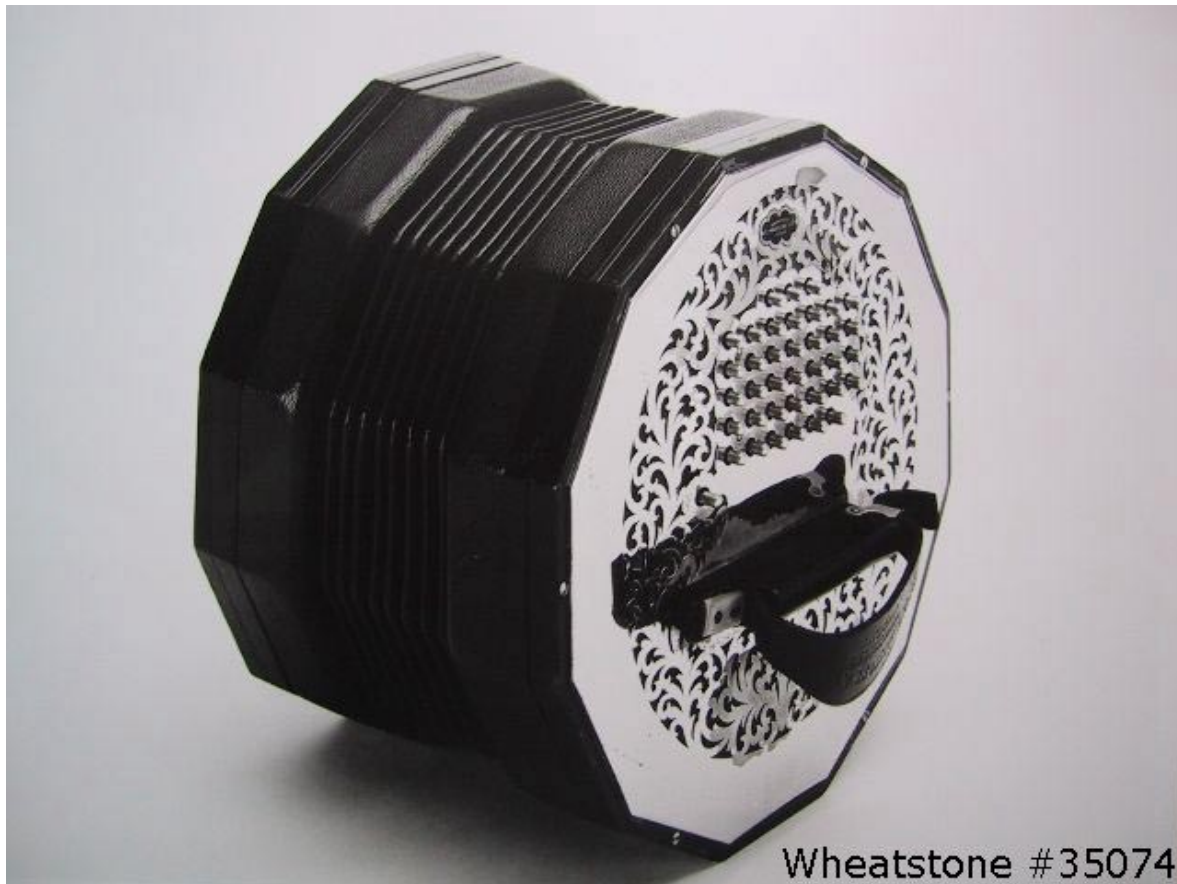
Fig. 1. Wheatstone Twelve-Sided Edeophone, #35074, right side.

The unusual Wheatstone #35074 was received from the seller within an apparently original square, hide case labeled with Wheatstone & Co.'s address in West Street (as current from 1897). Figure 1 is a photograph showing the right side of the concertina.