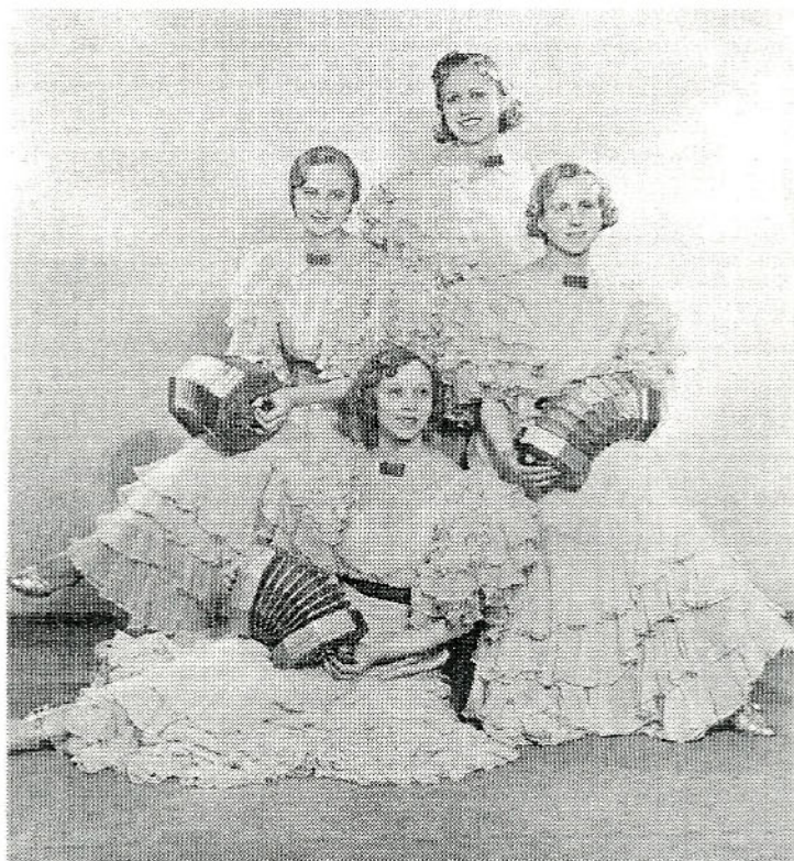
Fig. 1a-b. Two photographs of the Fayre Four Sisters as they appeared in the 1920s(?); the concertinas had a dull, gold finish, courtesy of Wheatstone & company