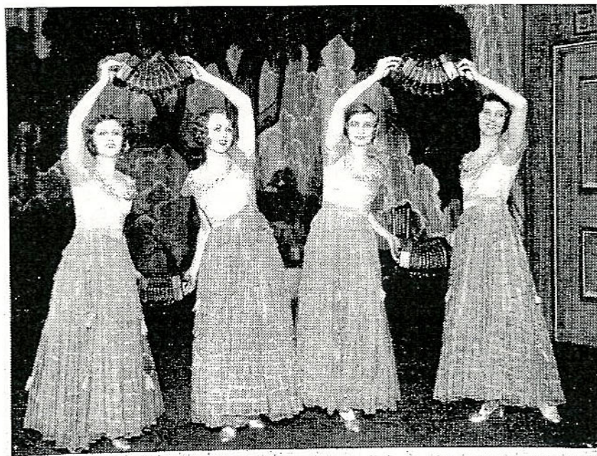
Fig. 3. The Fayre Four Sisters waltzing to The Blue Danube as they performed it.

For The Volga Boat Men , they performed the same trick, this time imitating the rowing of a boat. As Sylvia put it: