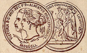
INTERNATIONAL EXHIBITION, 1851 & 1872.