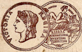
INVENTIONS EXHIBITION, 1885.