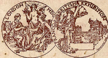
Grand Prize, 1908.