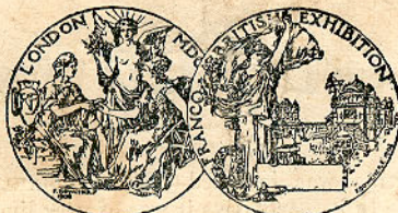
Grand Prize, 1903.