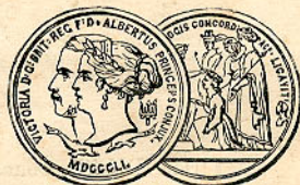
INTERNATIONAL EXHIBITION, 1851 & 1872.