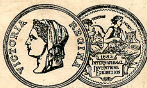
INVENTIONS EXHIBITION, 1885.