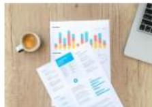
ACCOUNT NO. & INVOICES