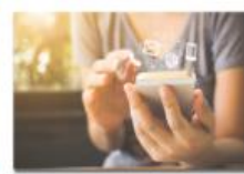
START OR STOP SERVICE