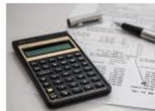
REQUEST AN ADJUSTMENT