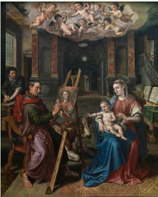
Medieval legend imagined that St Luke painted a portrait of the Virgin Mary. Hence, he is nominated as patron saint of artists. A number of medieval images show St Luke as a painter.

Letter of His Holiness Pope John Paul II to Artists (April 4, 1999).