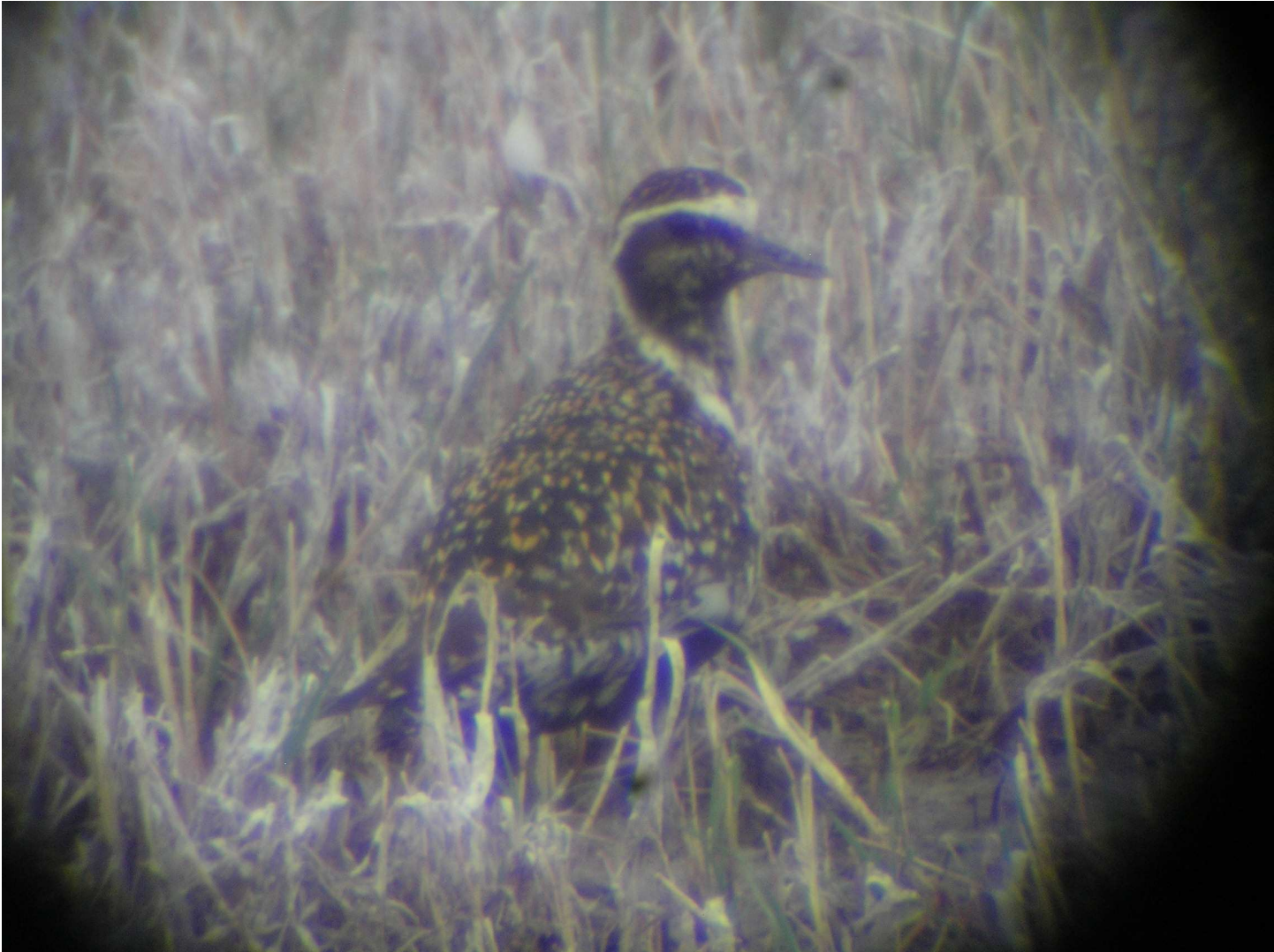
View showing the amount of white in undertail and vent areas and colorful back feathering. The very thin above eye line is also very obvious here.