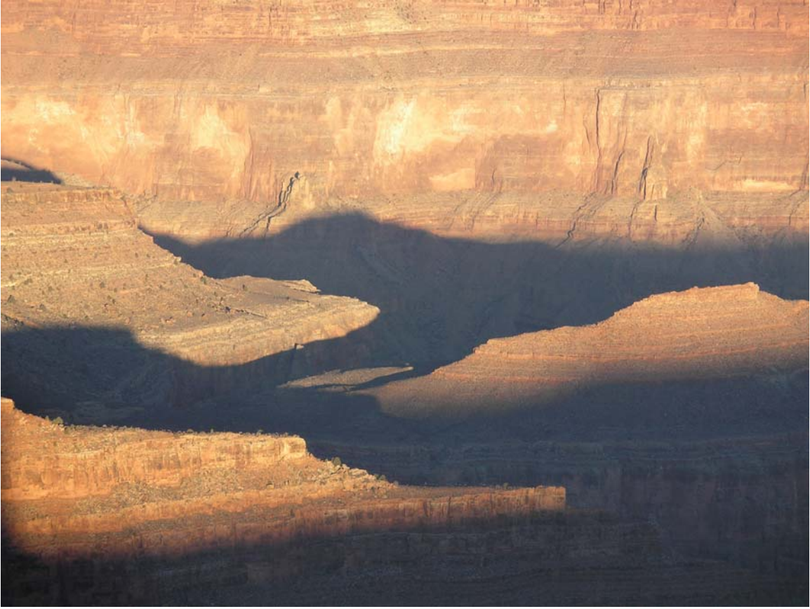
Morning in the Canyon. White's Butte (one of our waypoints) is visible center right.