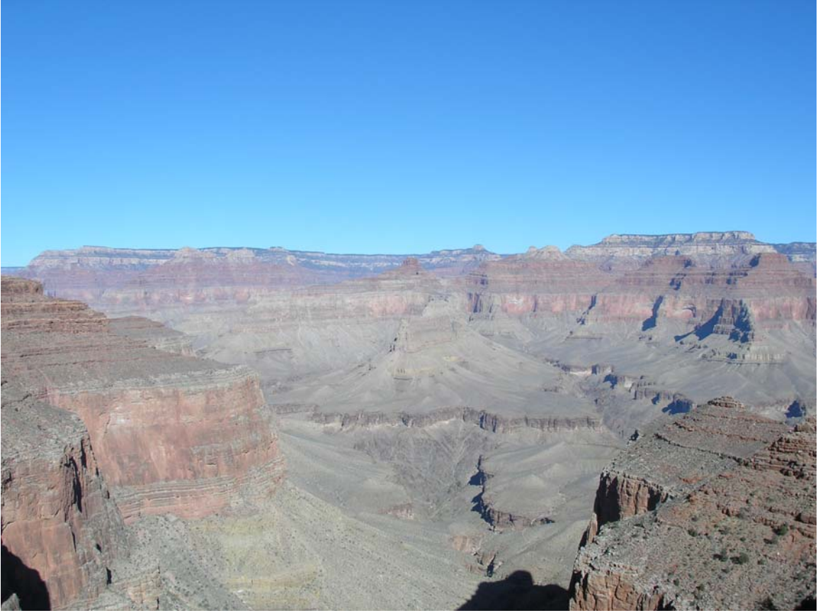
Looking north from the Hermit Trail.