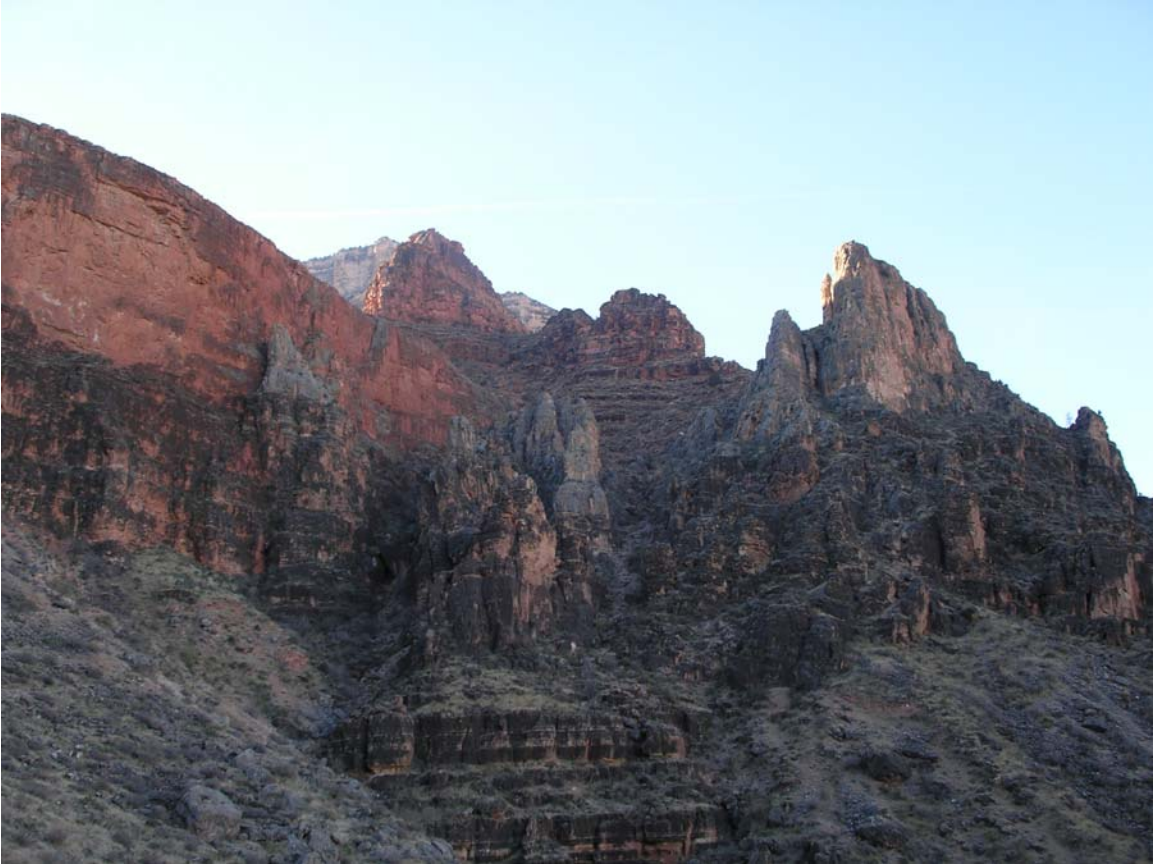
Looking up towards the Cathedral Stairs area.