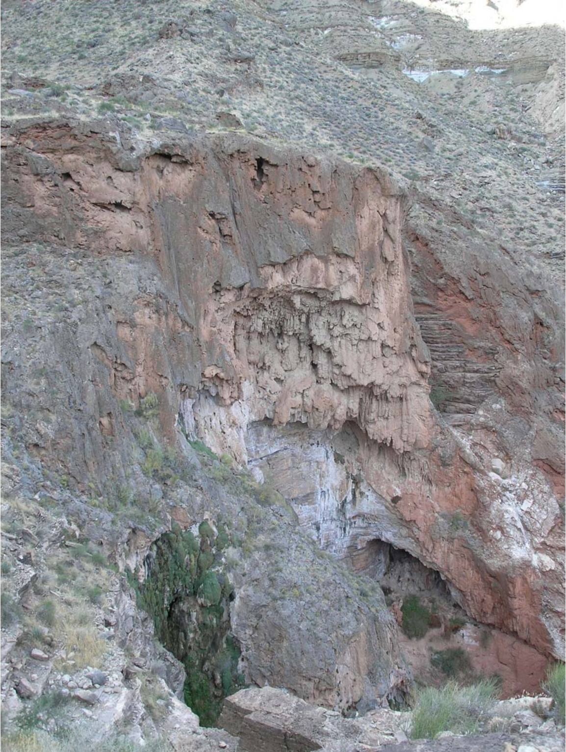
“Drape-like” travertine deposits in Travertine Canyon.