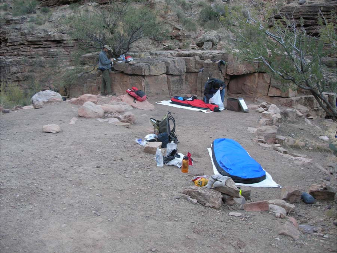
“Camp Sweet Home” at Hermit Creek.