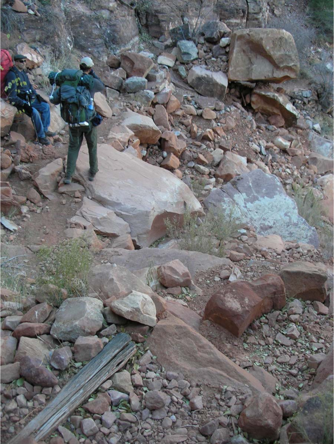
A rest break on the Hermit Trail.