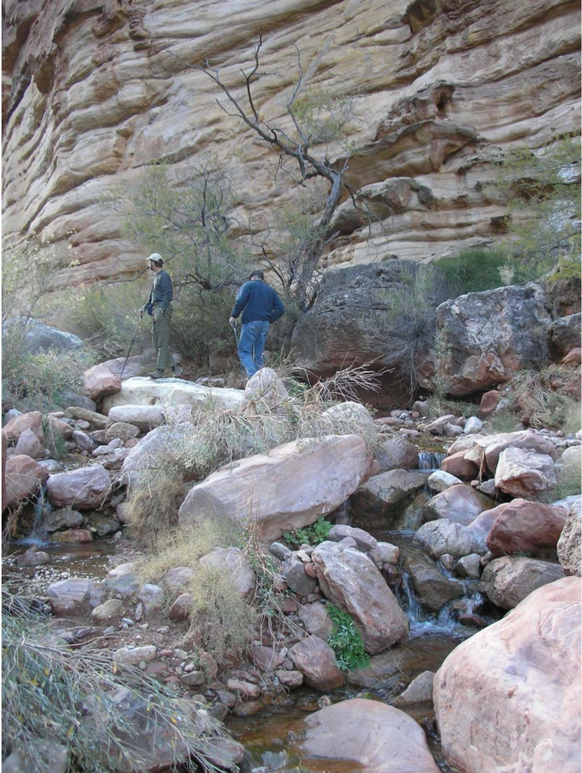
Exploring up Boucher Creek.