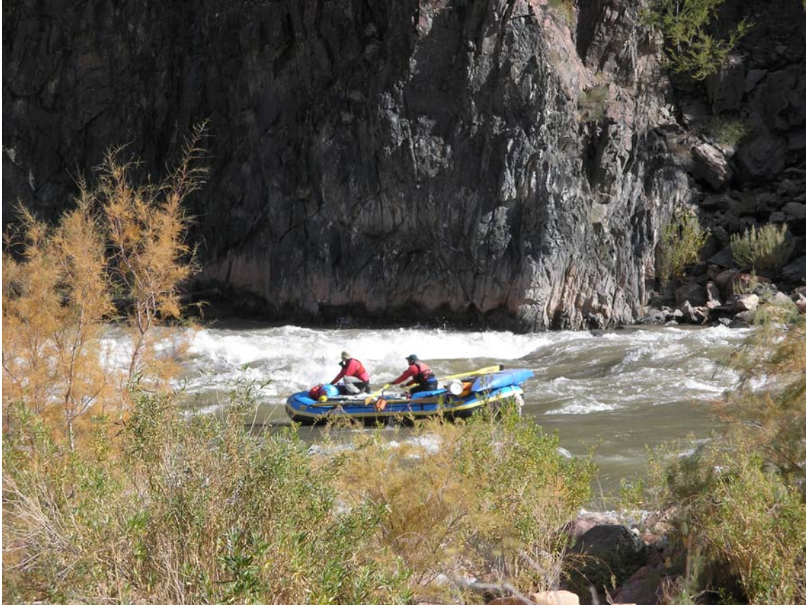
One of the boats from the raft party that passed by.