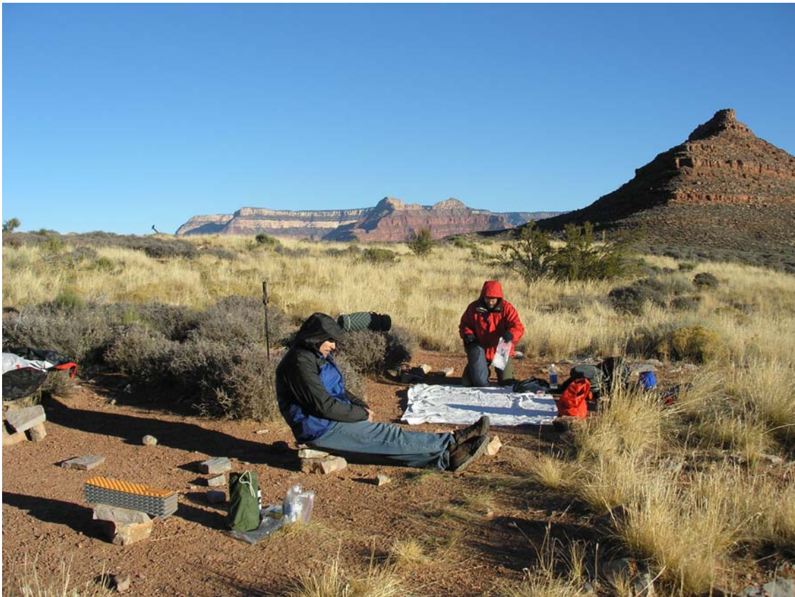
Morning on the White's Butte Saddle

Day 4 (Tuesday, December 6 th ): The temperature (teens at least) forced you to get in your bedroll to stay warm (or at least not as cold), but we just weren't used to being in "bed" for 12 to 13 hours. Naturally, we were up before dawn, but hopping around to try and stay warm. I had slept with one water bottle (i.e. potable, not just the "pee bottle") in the bivy to keep it from freezing; it was slushy, but still pourable. Frozen granola bars are quite a treat. As always, coffee was a priority. Eventually, and thankfully the sun started to come up. The sub-freezing temperature only slightly diminished the appreciation of the show as the cliffs on the north side of the river gradually began to catch the light. We were in no great hurry today, as we didn't have to cover much distance. As the sun became fully up we were greeted both by ravens (wondered where they had been last night) looking for an easy score and by the steady drone of the helicopters above. The tours pass almost directly above this point on their north to south leg. I'm not sure what altitude they are flying at, but it is pretty high above you and they follow a straight-line route. One comes by every few minutes. I had thought about "mooning" them, but they were too high and I was too cold.