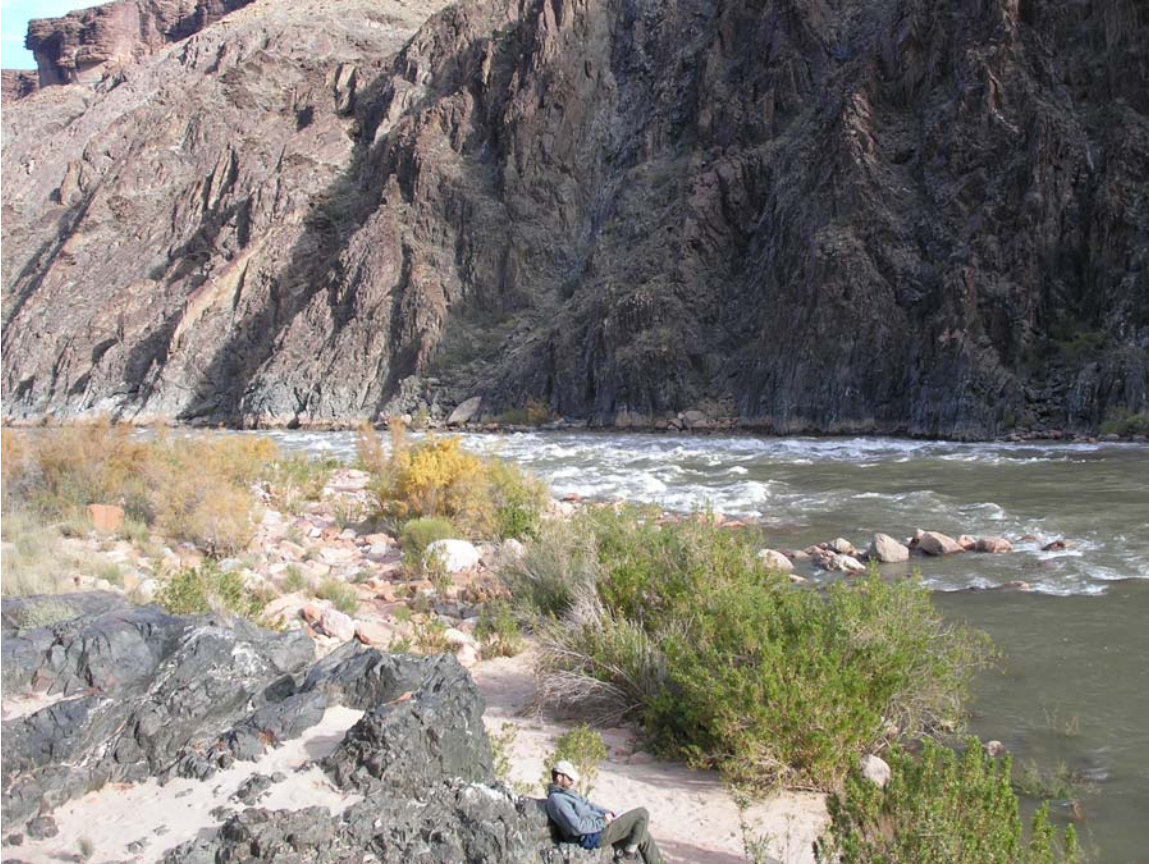
Cliff's idyll at Boucher Beach on the morning of Day 5.

Day 5 (Wednesday, December 7 th ). This was another short hike day so we had the morning to goof off. Our previous Grand Canyon trips had included such tight itineraries that we rarely had the luxury of enjoying a particular location for long. We spent some time exploring the area and just relaxing until late morning. As we were preparing to leave a pleasant surprise came down the river. A party of several rafts came into Boucher Rapids as we watched from the shore. Waves were exchanged as they passed by. Other than ourselves, we hadn't encountered any other people since leaving Hermit's Rest. We were surprised as we thought the river running mostly ended in October.