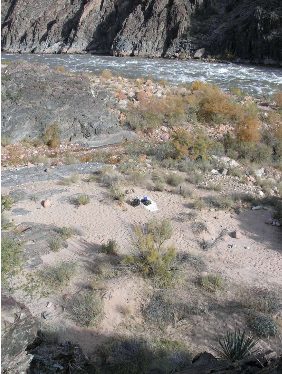
Looking down on my campsite from the previous night. View across Boucher Creek of Boucher Rapids.