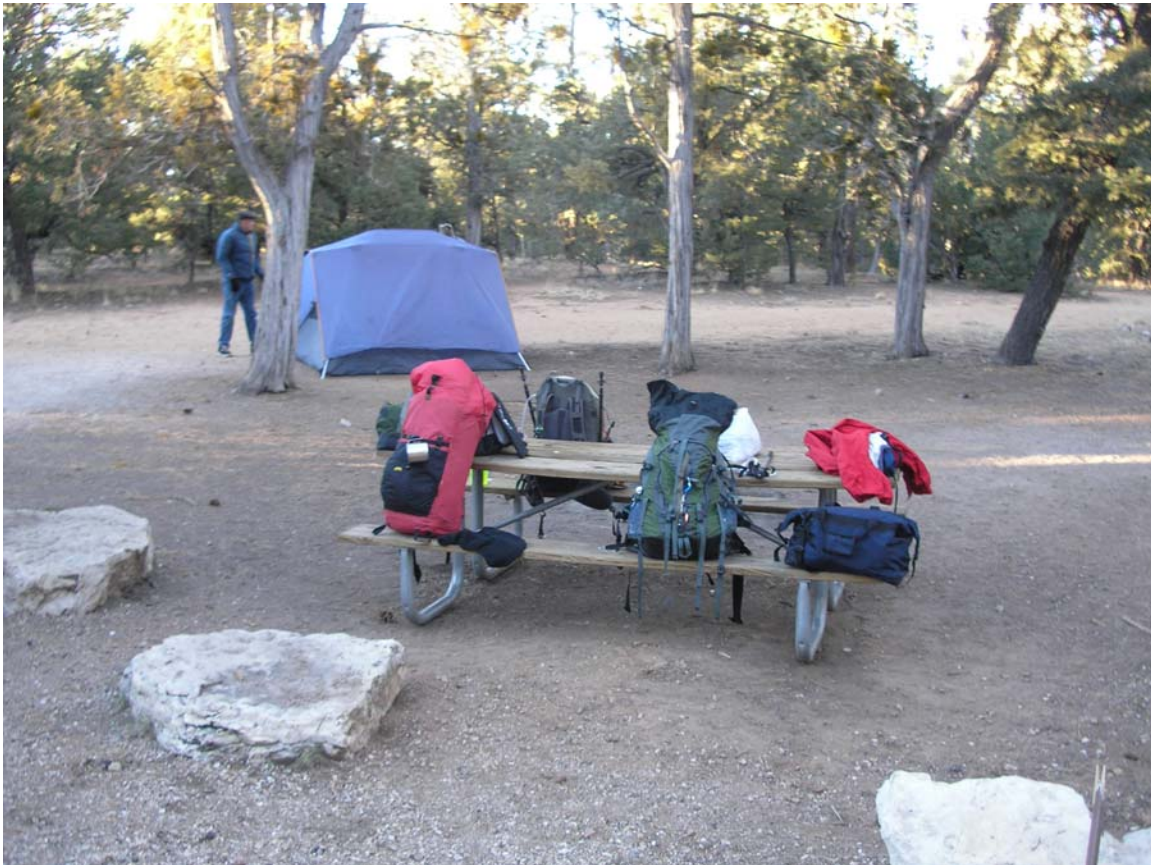
Gear mostly ready to go at Mather Campground.