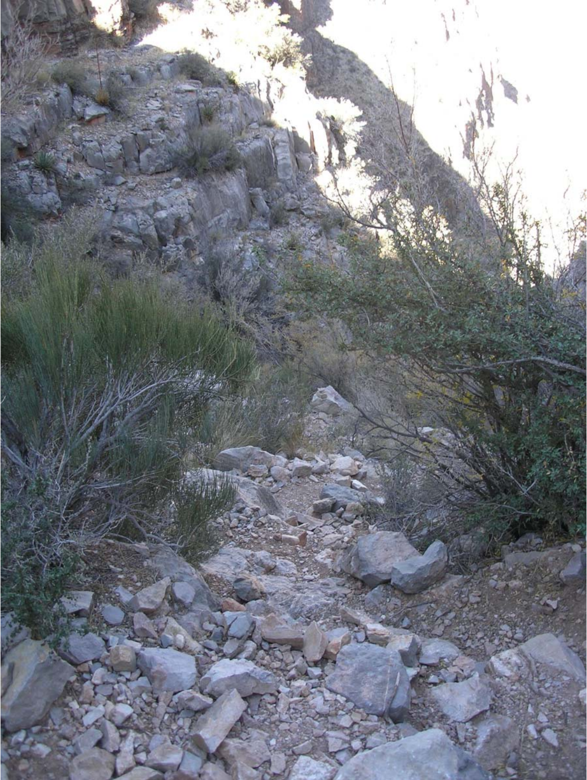
Looking down the Boucher Trail in the Redwall. Plenty of sharp scree to slip on in this steep section.