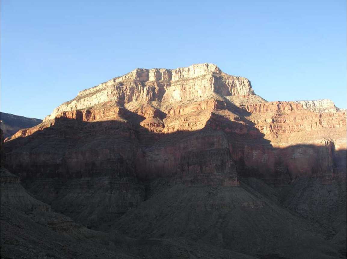
View of Pima Point from Hermit Creek Campsite.