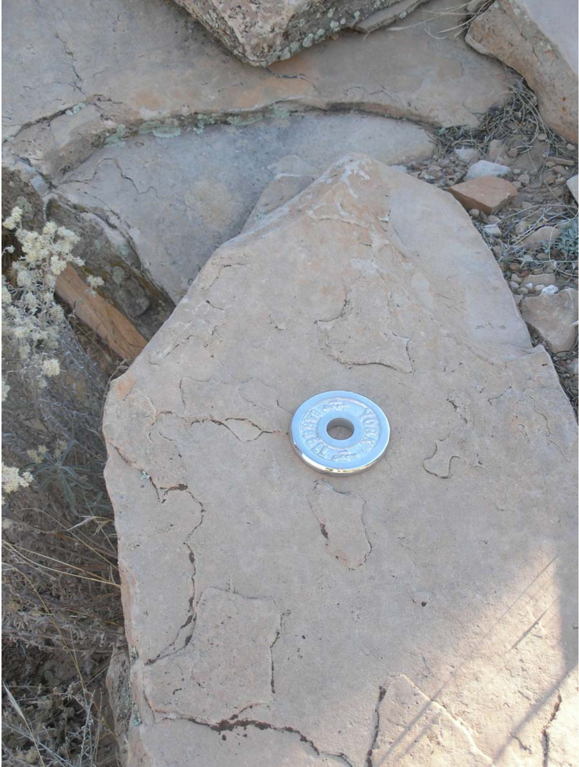
The great mystery barbell weight next to the upper Hermit Trail.