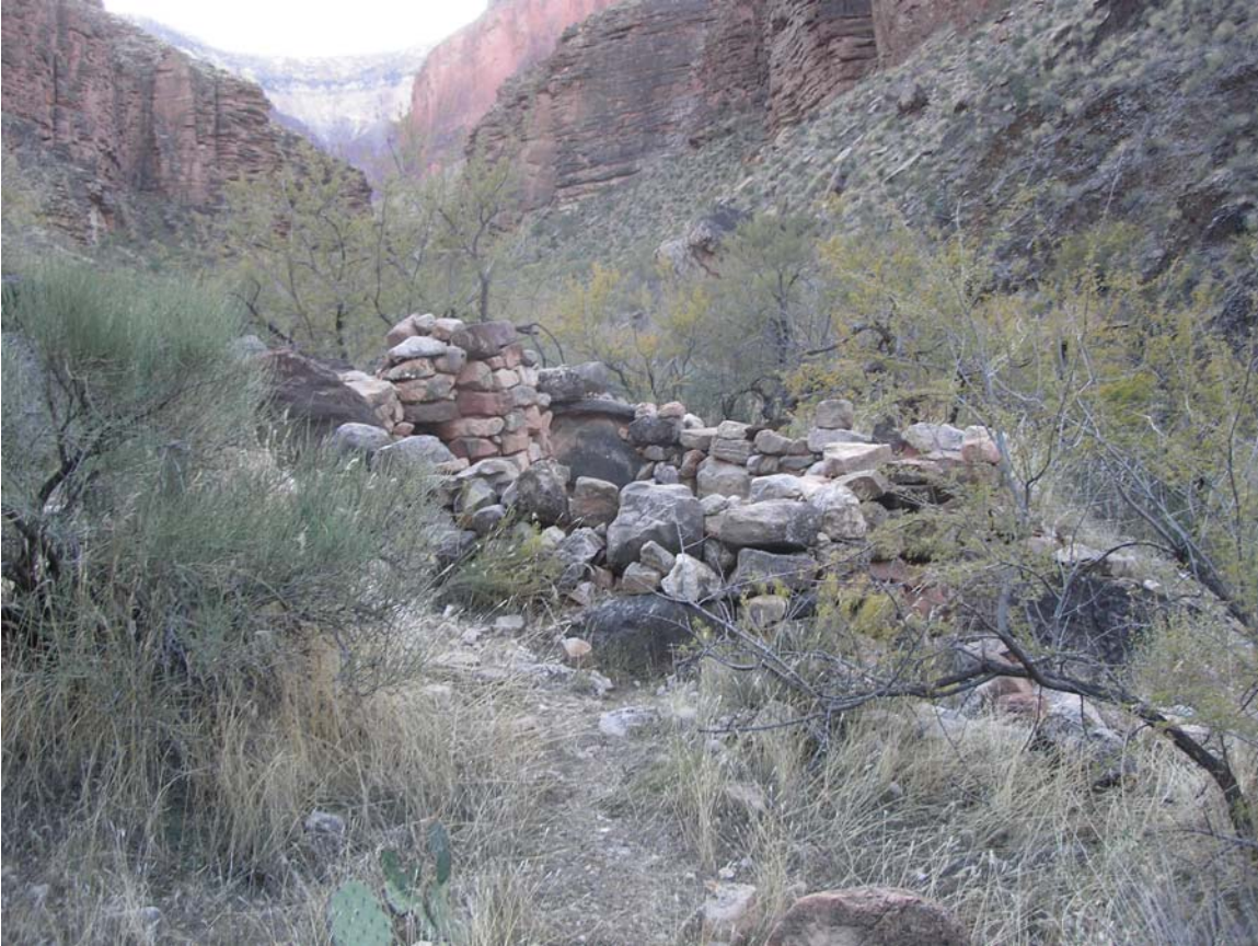
Ruins of Boucher's Cabin.

Nightfall brought another exceptionally clear sky. At one point we could just see Venus above the western rim of the area while Mars was just above the eastern. While cold, it wasn't horribly cold and we sat up talking for a couple of hours. The rodents were quite active as soon as darkness fell and futile attempts to shoo them kept us occupied for a while. We had suspended our food bags as best we could and hoped it would be sufficient protection from the "critters". As we sat and talked, we would occasionally hear the "pop" and tumble of a rock falling from the surrounding Tapeats cliffs. I assume this was brought about by thermal stress delivering the coups de grace to an already loose fragment. Jim was a little unnerved by these sounds that echoed about us and what they implied for the ultimate stability of our surroundings. I decided to comfort him by pointing out the large blocks in the area that had obviously tumble a significant distance prior to coming to rest. "Who knows Jim, maybe a large mass movement will land on top of us tonight!" Jim was not amused. I'm always glad to help. All in all, another fantastic day and really long December night in the canyon.