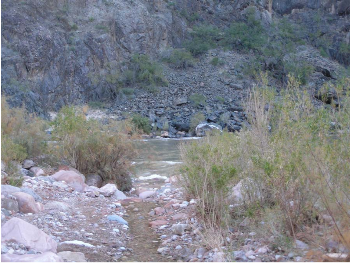
The mouth of Boucher Creek and the Colorado River.