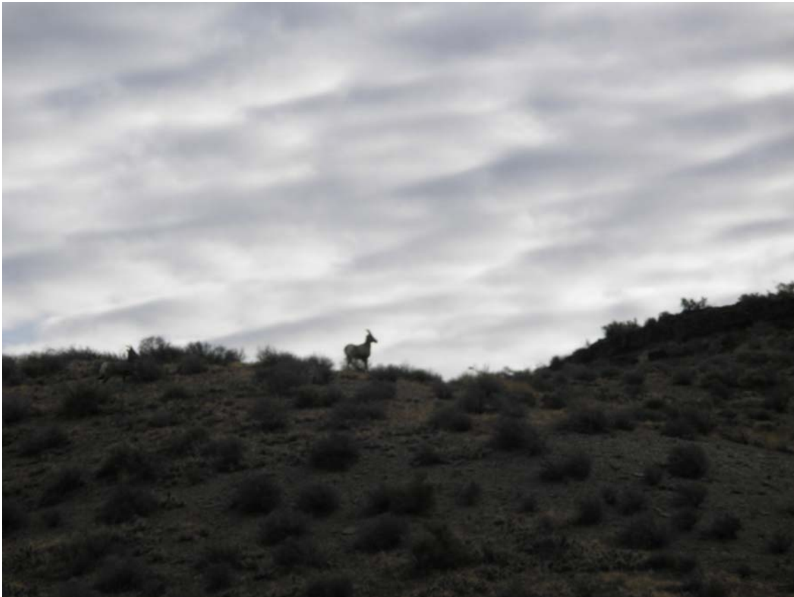
Fauna on the Tonto.

“varmint” had managed to climb to it and chew into it. I opened the bag with trepidation to see what damage had been done. Loss of food is a big deal as we attempt to travel light and have very limited stores...good thing I’m carrying 20 extra pounds of body fat. The target had been my gorp stores. I had small snack size individual pouches that were enclosed in a large zip lock within the nylon stuff sack. The surprise was the deer mouse that was still in the large zip lock. Apparently, he hadn’t been able to find his way out. Even more amazing, he had helped himself to only one of the bags of gorp. The others were intact. I briefly considered whether it was “thumbs up” or “thumbs down” for this little fellow who had clearly been turned delinquent by human contact. I admired his pluck and set him free.