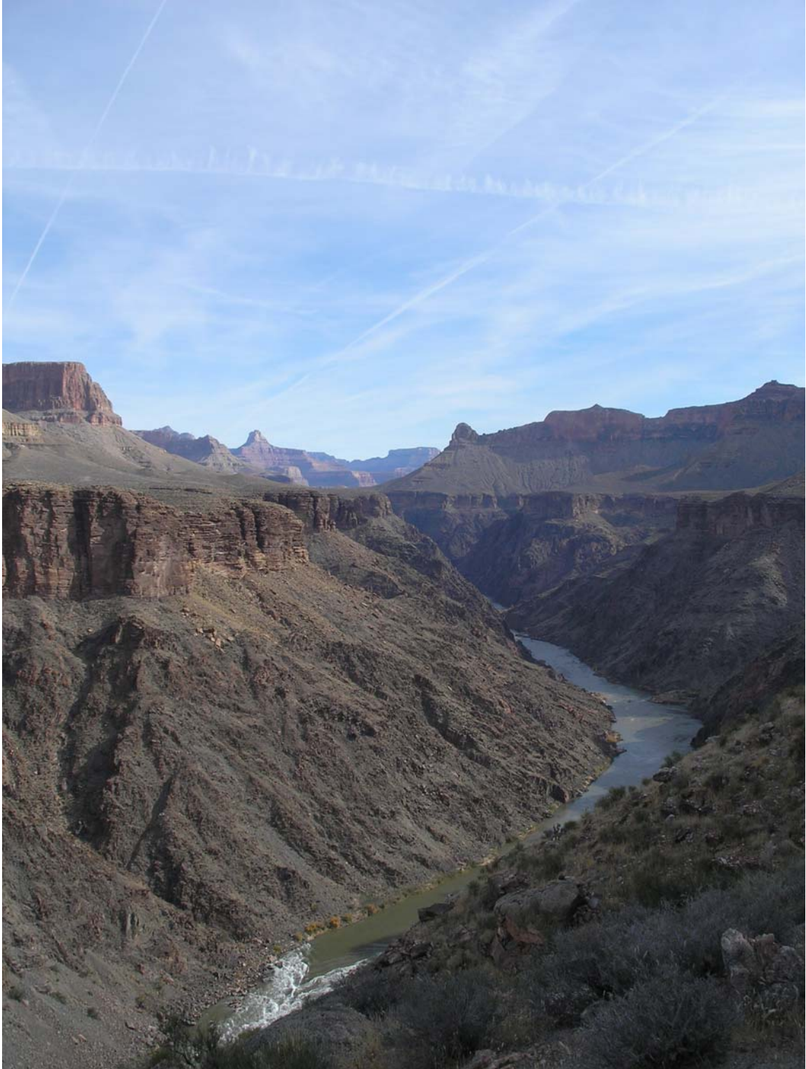
Looking up canyon from the Tonto Trail between Travertine Canyon and Hermit Creek. Hermit Rapids is visible below.