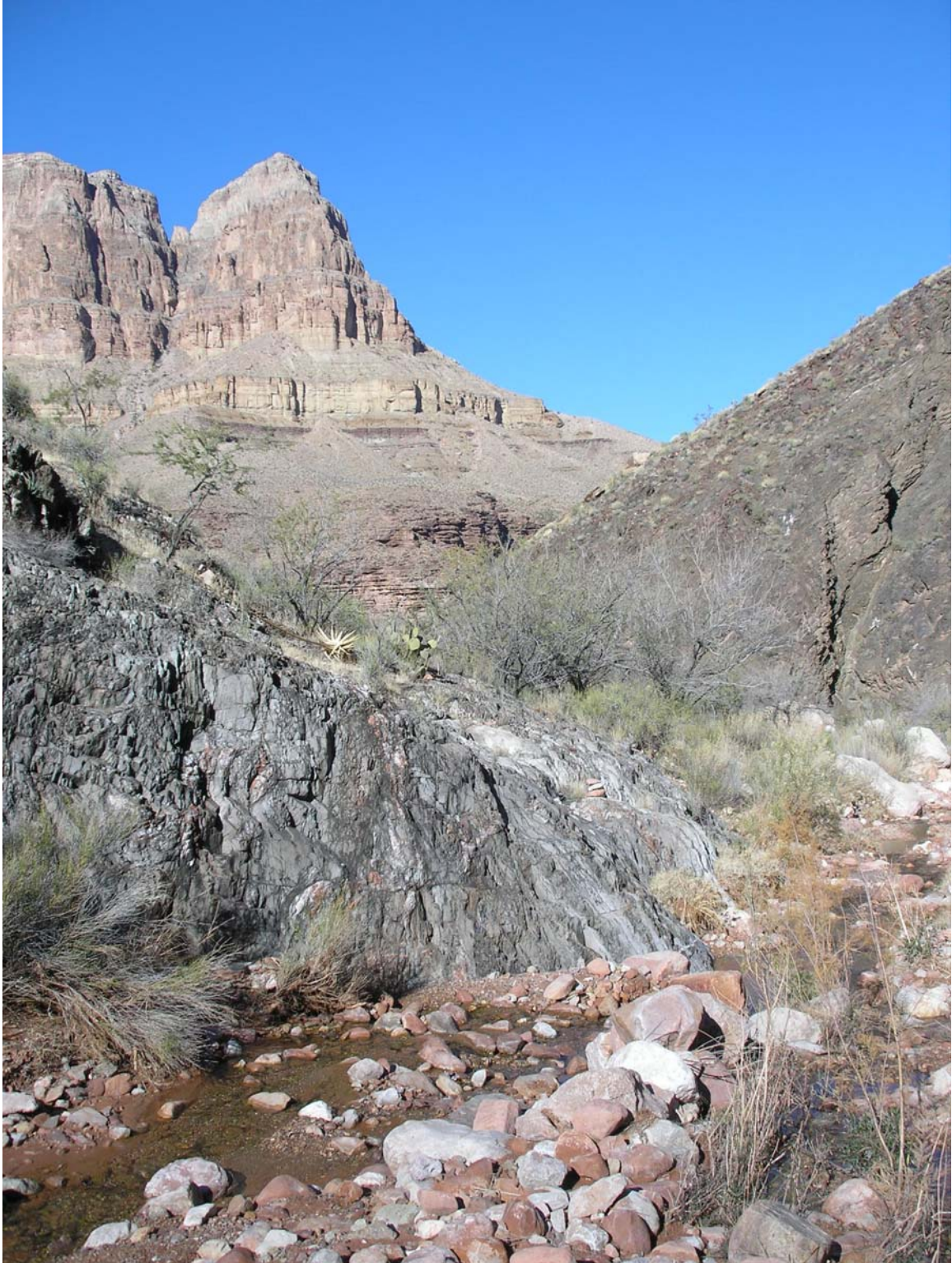
View generally to the north (downstream) along Boucher Creek. Precambrian rocks in the foreground and Tapeats outcrop just visible around the bend.