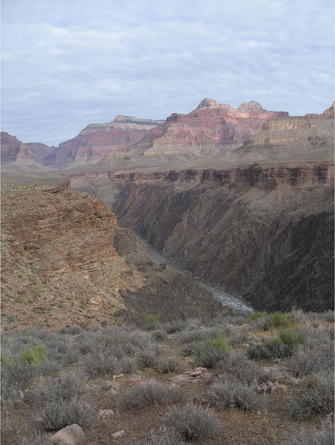
Looking down canyon on the Tonto Trail between Boucher Creek and Travertine Canyon.